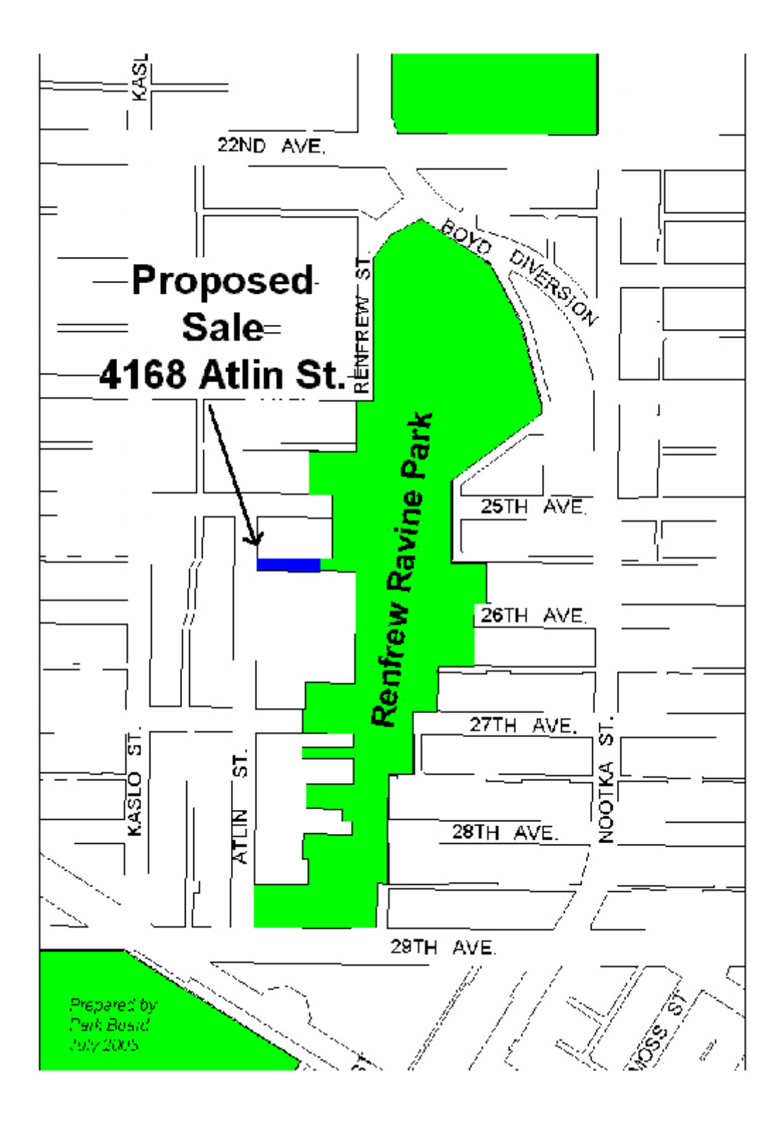
Appendix B - Map Showing Proposed Property for Sale