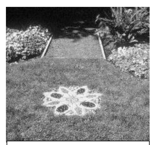
Pebble mosaic in West Point Grey facilitated by Artist in Residence Glen Andersen (2000)