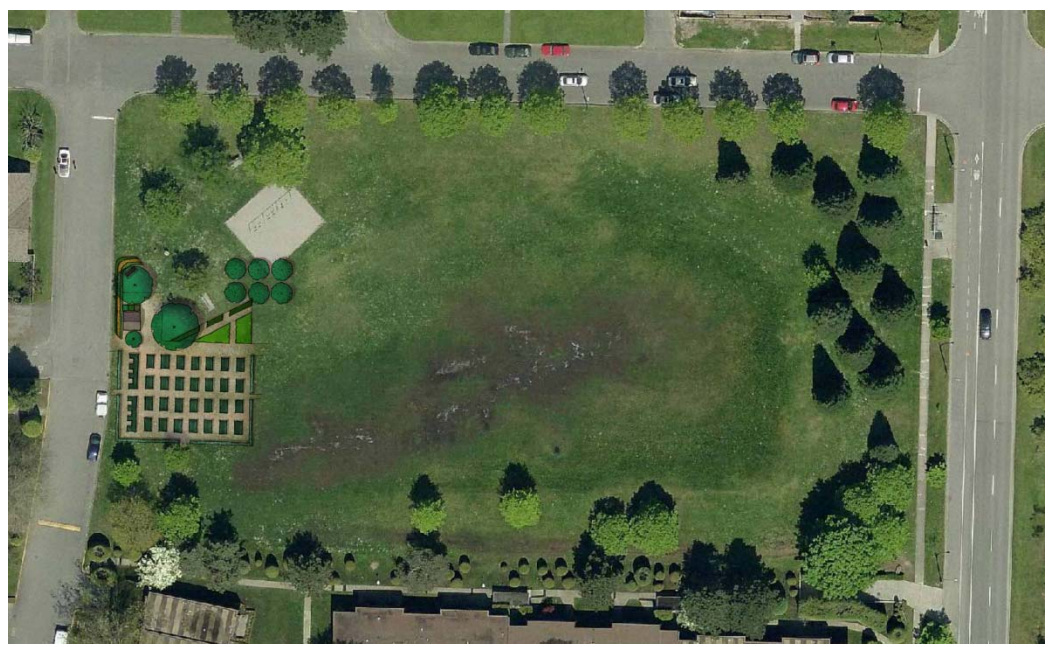
Figure 1: Location of proposed community garden in Cambie Park

Cambie Park is bordered on one side by single-family housing, and on the other side by multi-family housing. The City has approved the Cambie Corridor Plan that allows for significant increases in density over the coming years. In the long term, Park Board staff intend to enhance the park with more features for a variety of park uses. The proposed garden location has been carefully chosen along the Ash St. edge of the park to not encumber any future park enhancement (Figure 1). While the Cambie Corridor has plenty of park space, South Vancouver is underserved with regard to community garden spaces.