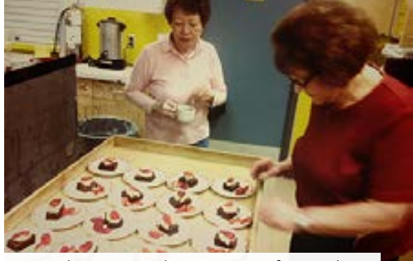
Lunch program volunteers at Renfrew Park