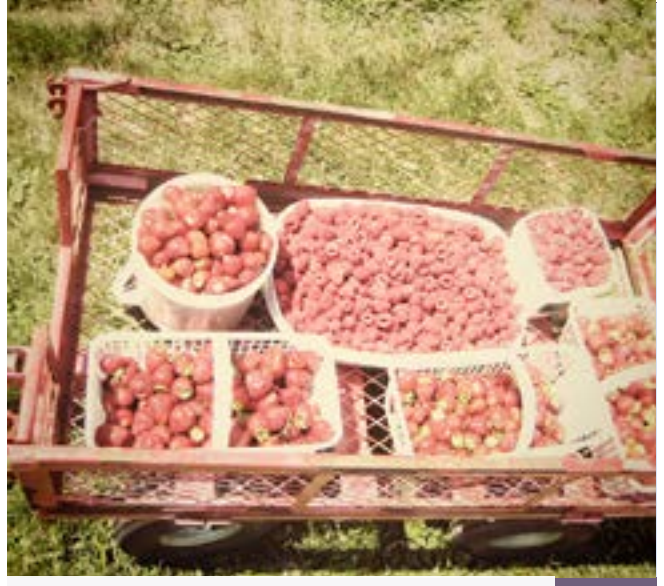
The bounty after a day of berry picking

» Participation in food programs offered by Park Board.