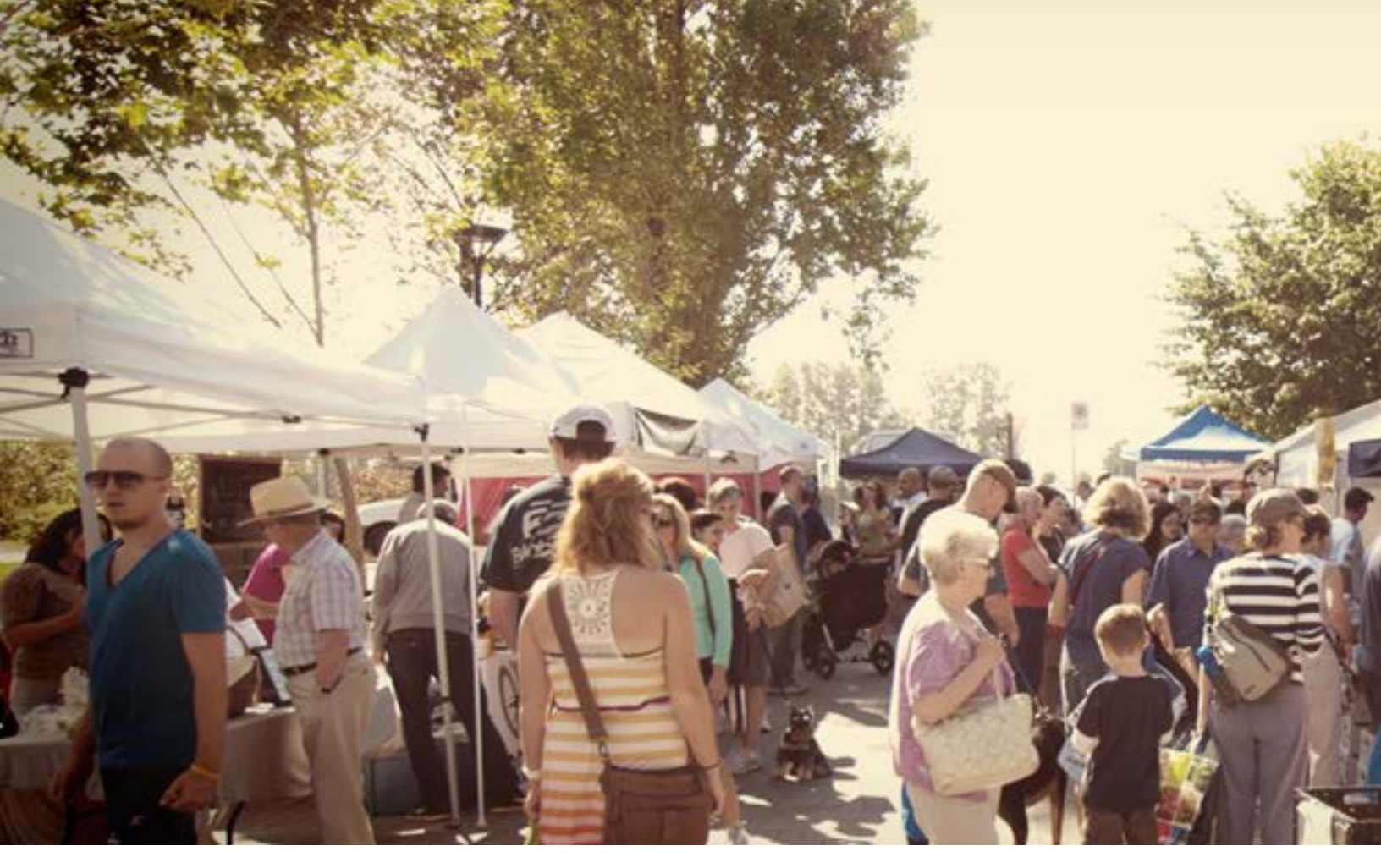
✓ Five farmers markets are located on or adjacent to Park Board land, with a considerable selection of locally grown and processed foods for city residents.

in parking lots of three community centres (Trout Lake, Kitsilano, Hillcrest) currently operate under special events permits, issued by the Park Board for a fee. Two farmers markets are located jointly on City- and Park Board land: Thornton Park and Nelson Park; the latter makes use of a Park Board water connection recently installed at the site. Two of these farmers markets offer complimentary bicycle valet service and food scraps drop-offs during market hours.