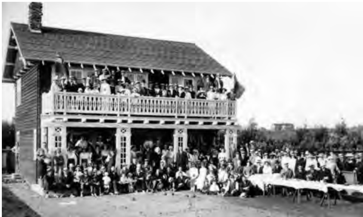
Opening Day of the Vancouver Lawn Bowling Club, 1912.