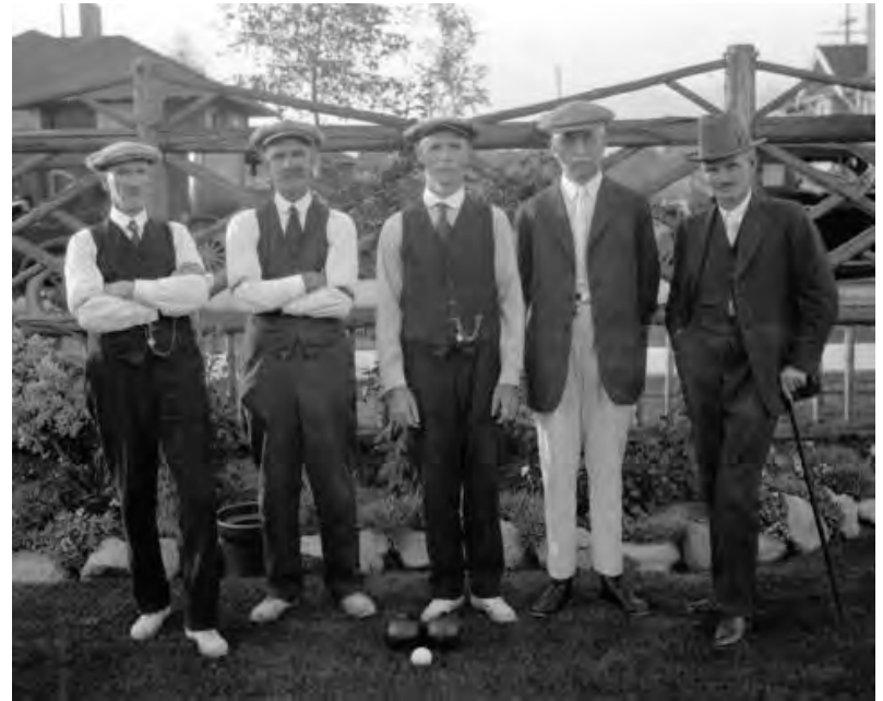
Group portrait of men at the Vancouver Lawn Bowling Club, 1923.