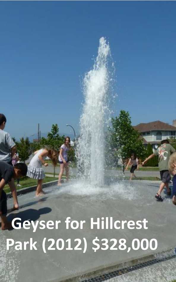
Geyser for Hillcrest Park (2012) $328,000