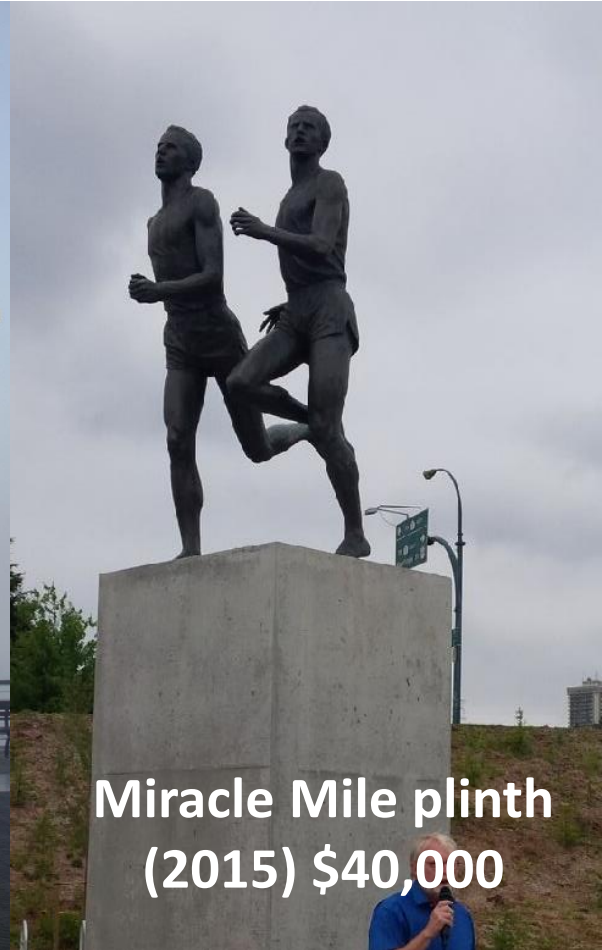
Miracle Mile plinth (2015) $40,000