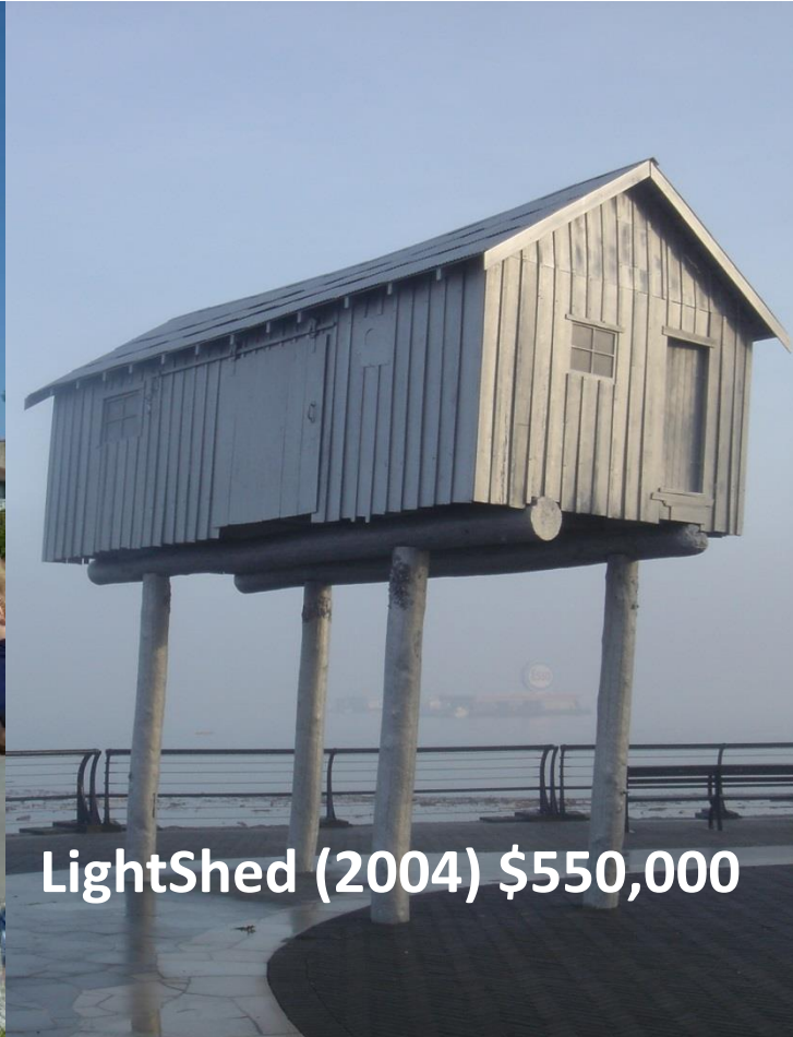
LightShed (2004) $550,000