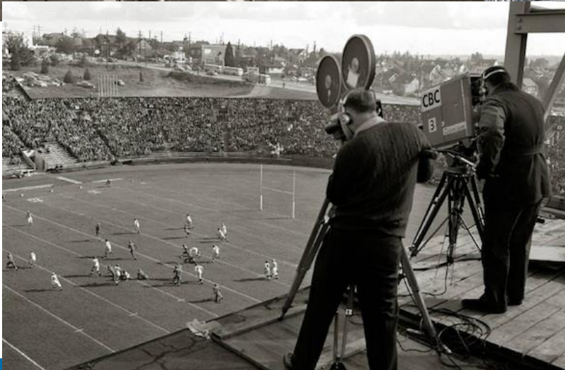
CBC televising the first CFL game from atop Empire Stadium (1958)