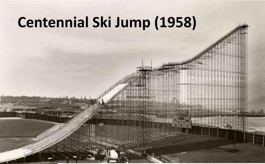
Centennial Ski Jump (1958)