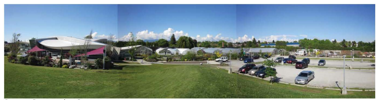
Sunset Community Centre