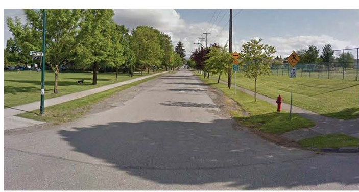
Prince Edward Street at 53rd Avenue