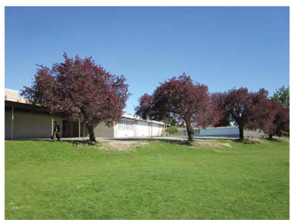
John Henderson Elemetary - Eastern park edge