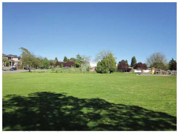
East side open lawn area