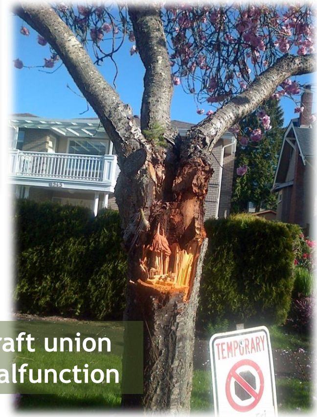
Graft union malfunction