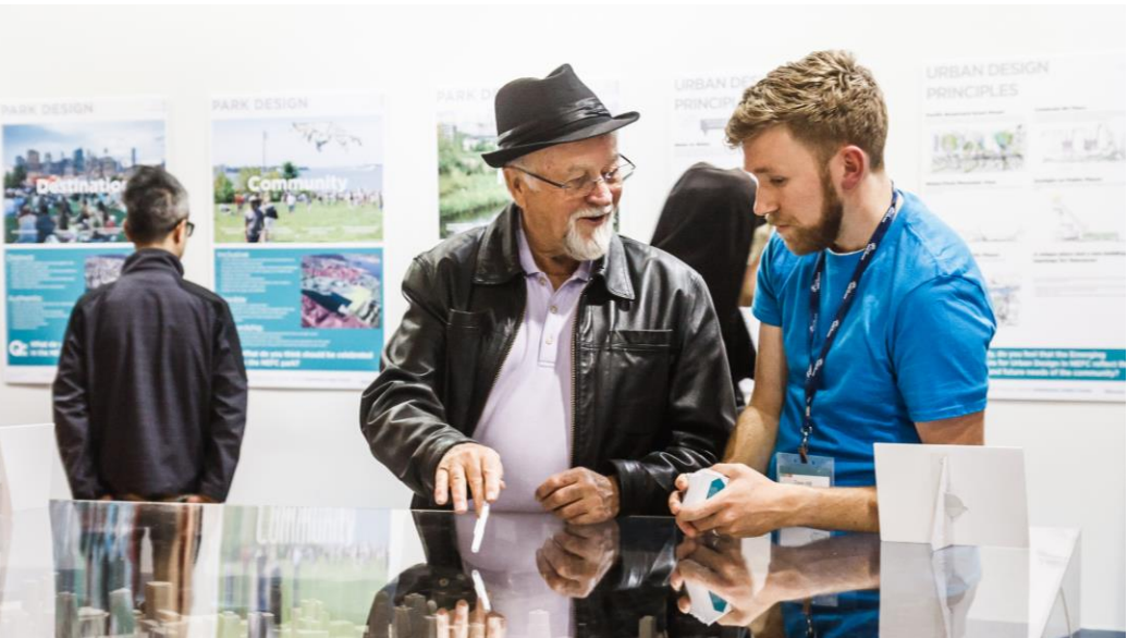
Park design is being refined with input from the Park Design Advisory Group and Design Explorations Stakeholder's Workshop.