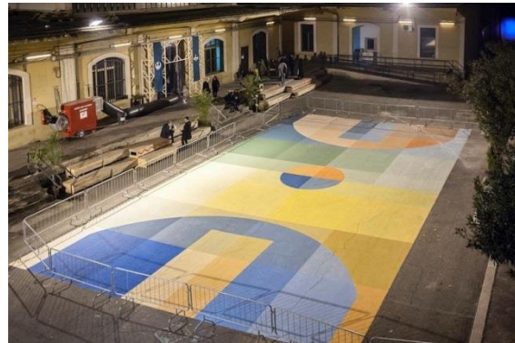
Rome court mural by street artist Alberonero

The mural proposed for Mount Pleasant Park will be an abstract in water tones of green and blue; the theme is fluidity reflecting the history and current use of the site including;