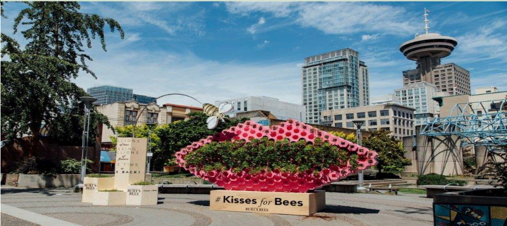
“Kisses for Bees” temporary pollinator Garden