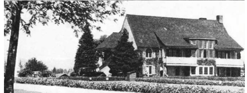
Clubhouse at Langara, CPR-built Vancouver course