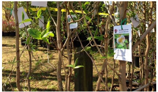
Online tree sales will go live May 1, 2018 with pick up events on May 12 & 13