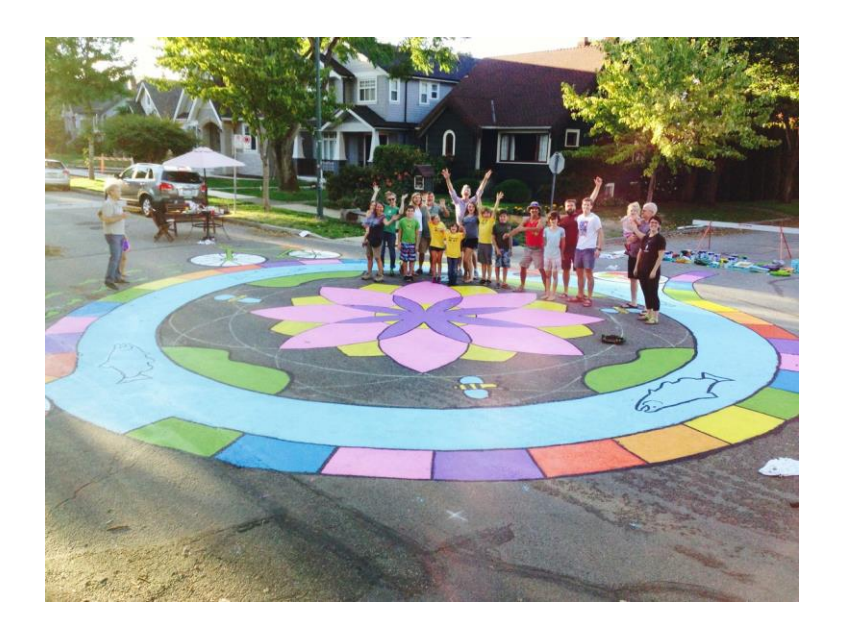
April 15, 2018 – Due date for applications for community projects that supported neighborhood-based groups to make creative improvements related to local food, stewardship, or art on public land.