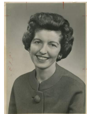
Commissioner 1960-66 Vancouver Park Board