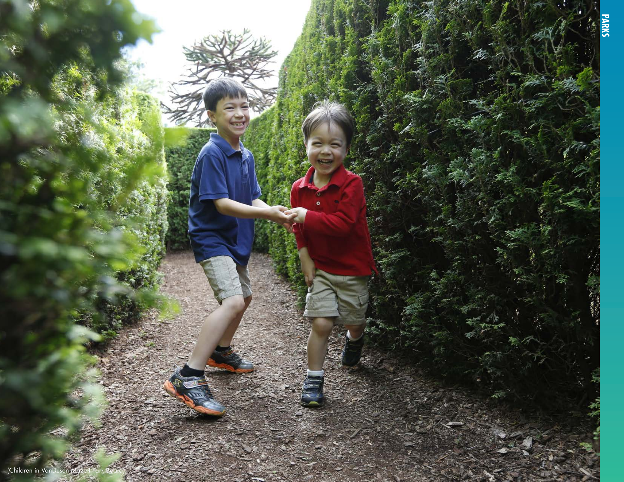
(Children in VanDusen Maze)