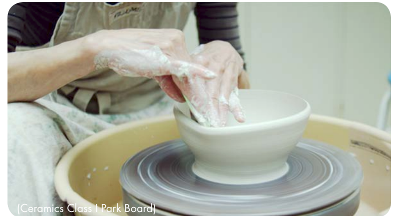
(Ceramics Class | Park Board)