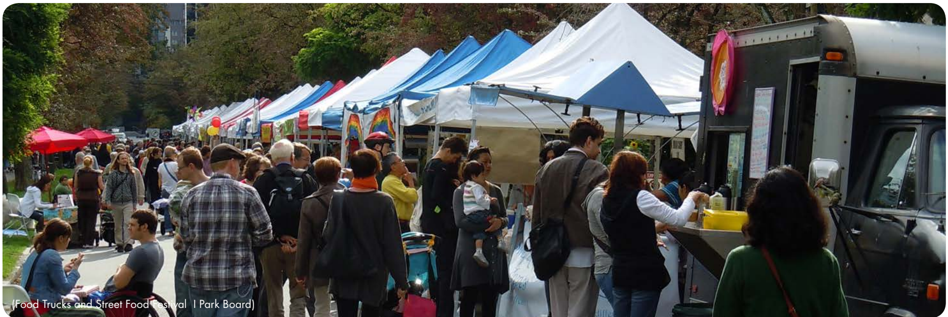
(Food Trucks and Street Food Festival | Park Board)