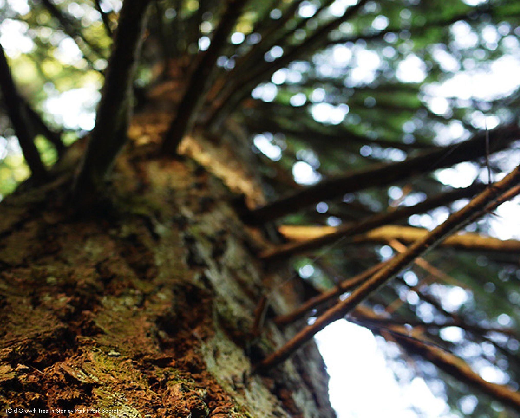
(Old Growth Tree in Stanley Park | Park Board)