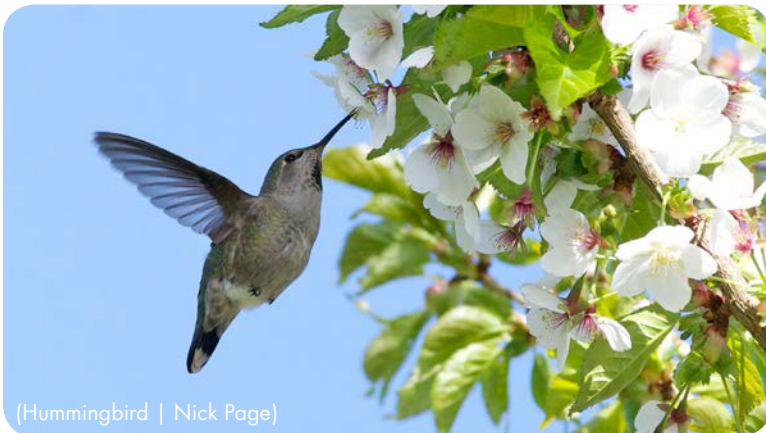
(Hummingbird | Nick Page)