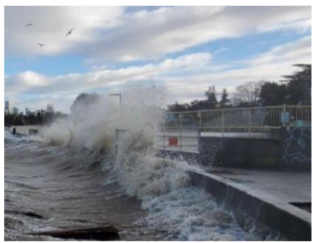
Kits Pool 2022 King Tide Event