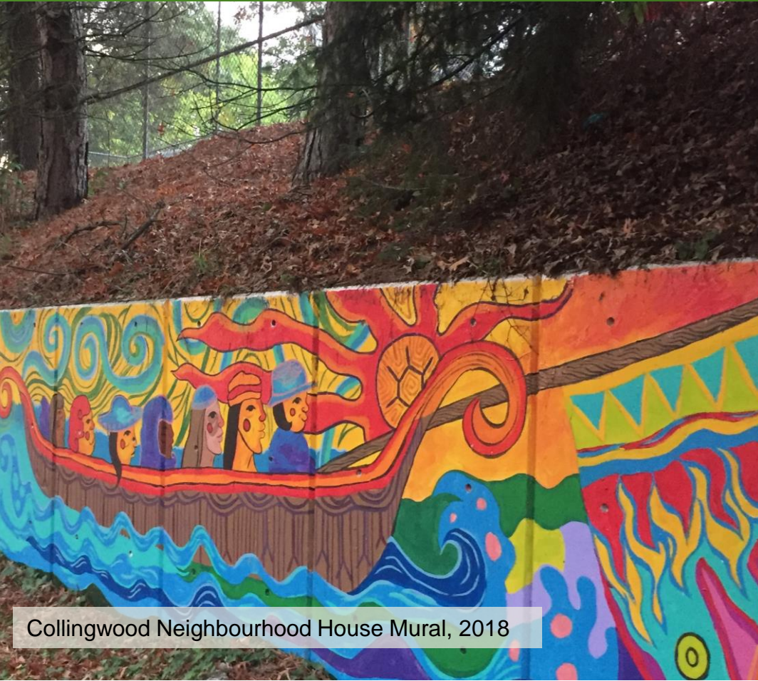
Collingwood Neighbourhood House Mural, 2018

Established in 1994, The Neighbourhood Matching Fund (NMF) funds and supports neighbourhood-based projects that facilitate community cultural development and foster community stewardship of park land and other public spaces.