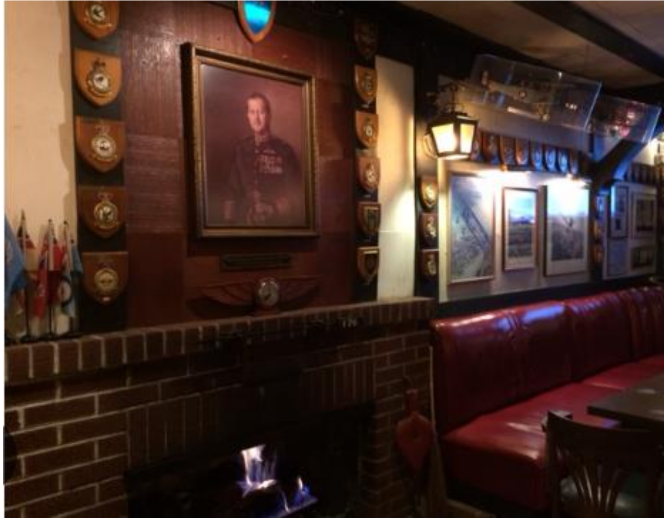
Commissioner Bastyovanszky attended a Remembrance Day gathering at Billy Bishop Legion in Kitsilano alongside Mayor Ken Sim