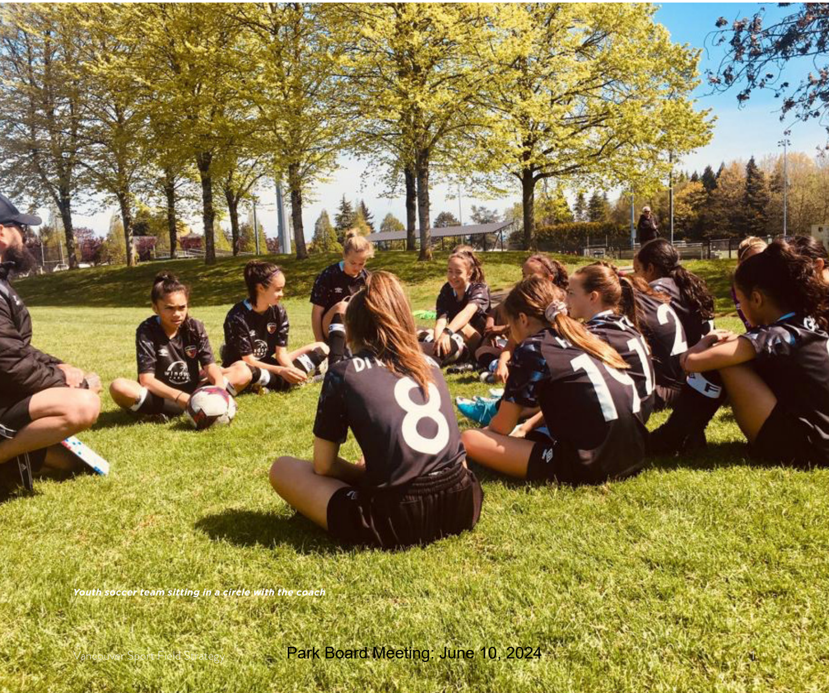
Youth soccer team sitting in a circle with the coach