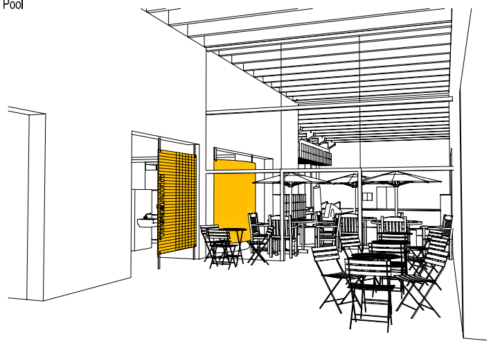
VIEWING LOUNGE PERSPECTIVE