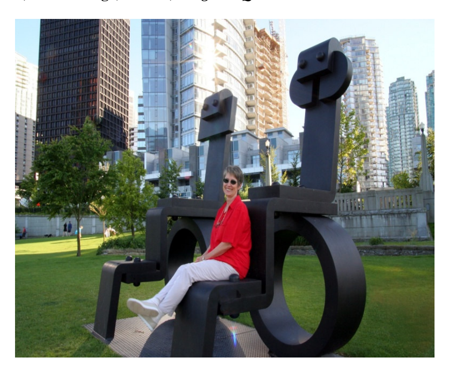
Proposed Exhibition Site (same as current): Harbour Green Park