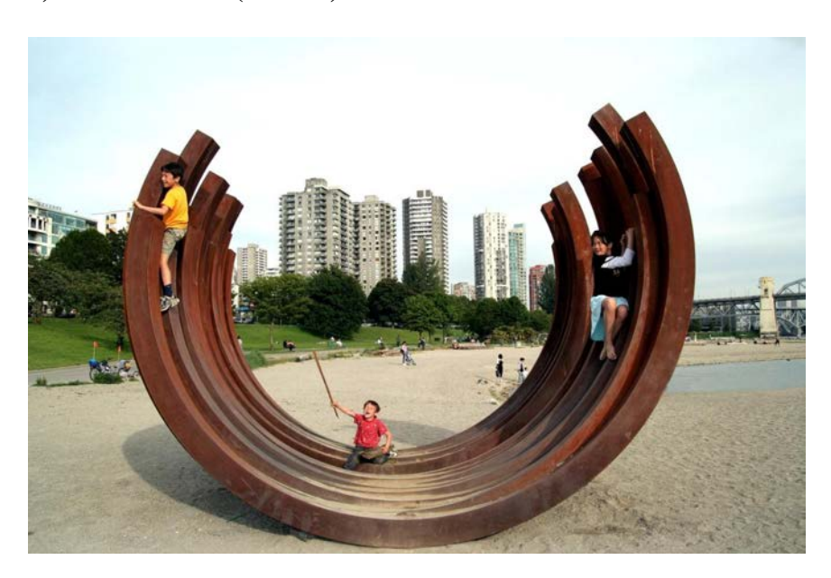
Proposed Exhibition Site: Sunset Beach