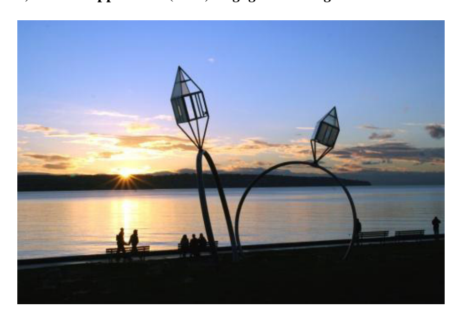
Proposed Exhibition Site: Sunset Beach Park at the foot of Broughton and Nicola