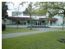
Dunbar Community Centre