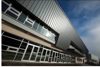
Vancouver Olympic and Paralympic Centre