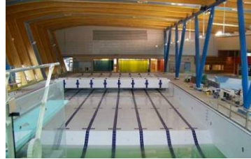
New Percy Norman Pool