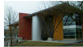
Millenium Sport Facility

Vancouver Board of Parks and Recreation | vancouverparks.ca