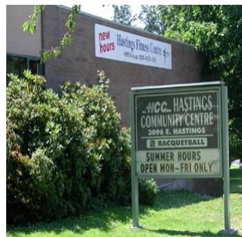
Hastings Community Centre

Vancouver Board of Parks and Recreation | vancouverparks.ca