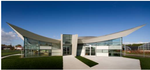
Sunset Community Centre

Vancouver Board of Parks and Recreation | vancouverparks.ca