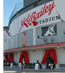
Nat Bailey Stadium