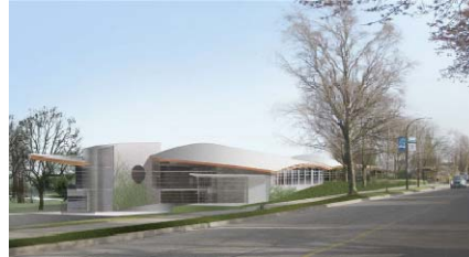
Trout Lake Community Centre (concept)