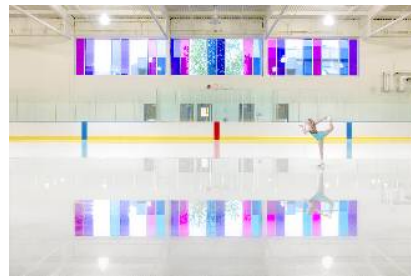
Killarney Community Centre Rink

Vancouver Board of Parks and Recreation | vancouverparks.ca