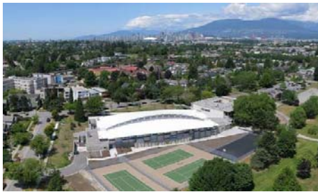
Trout Lake Community Centre Rink