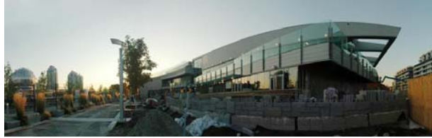
Southeast False Creek Community Centre