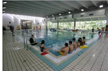
Renfrew Community Centre Pool

Vancouver Board of Parks and Recreation | vancouverparks.ca