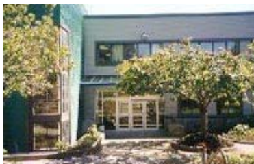
Marpole-Oakridge Community Centre