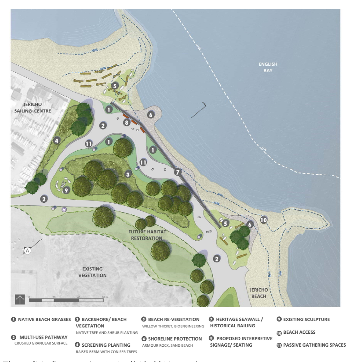
Figure C-1: Concept plan A, April 12, 2011 open house