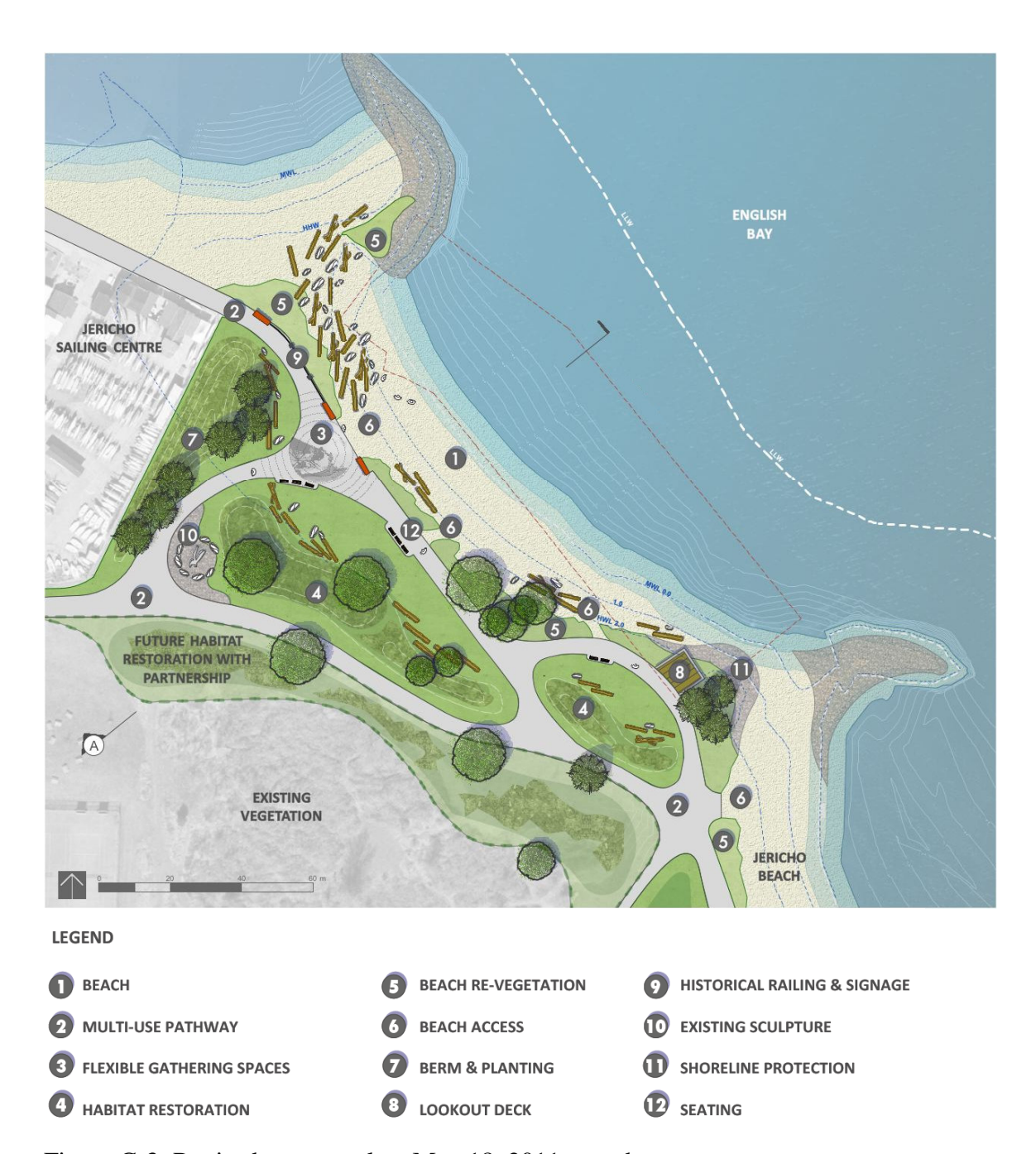
Figure C-3: Revised concept plan, May 18, 2011 open house