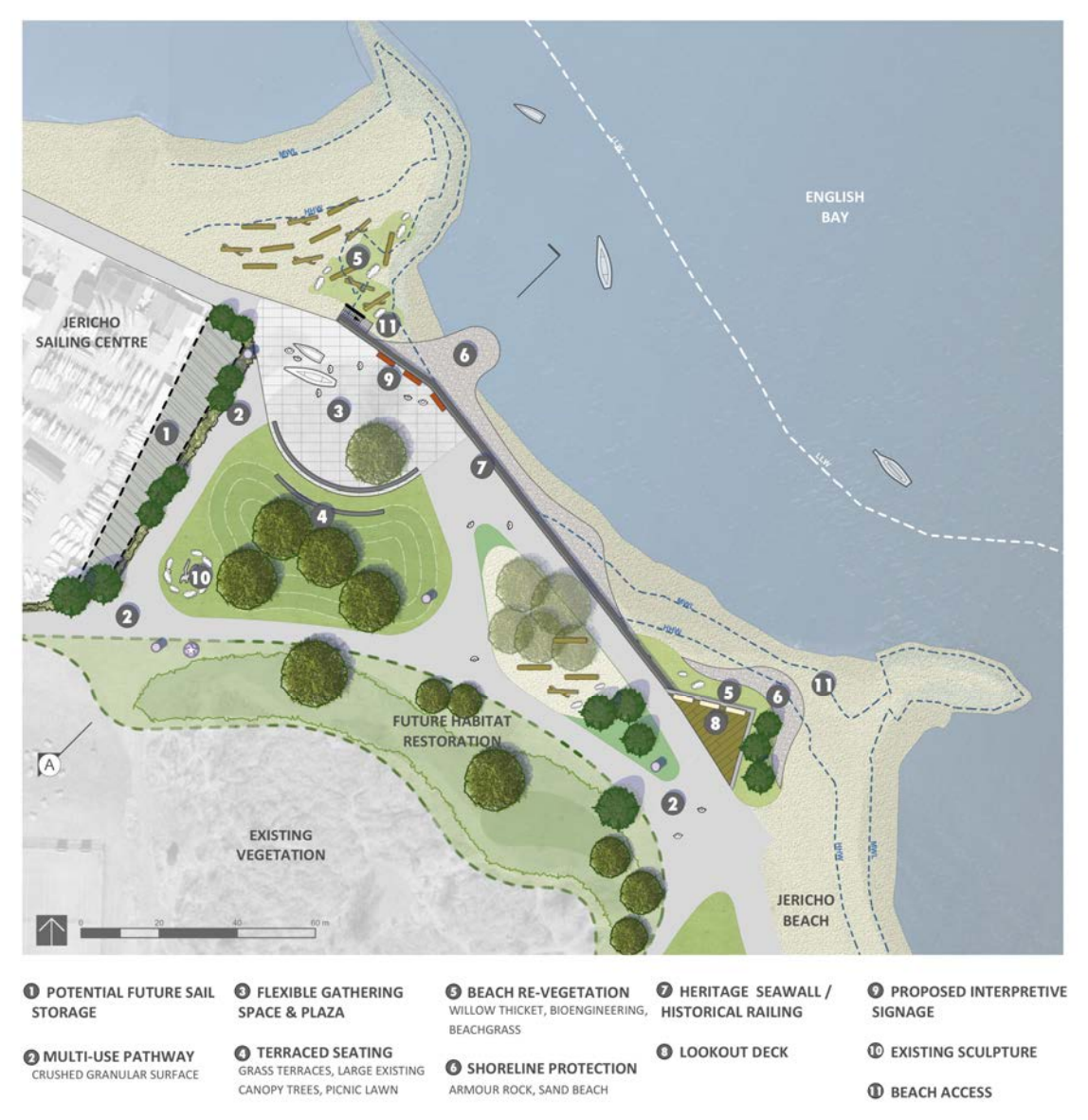
Figure C-2: Concept plan B, April 12, 2011 open house