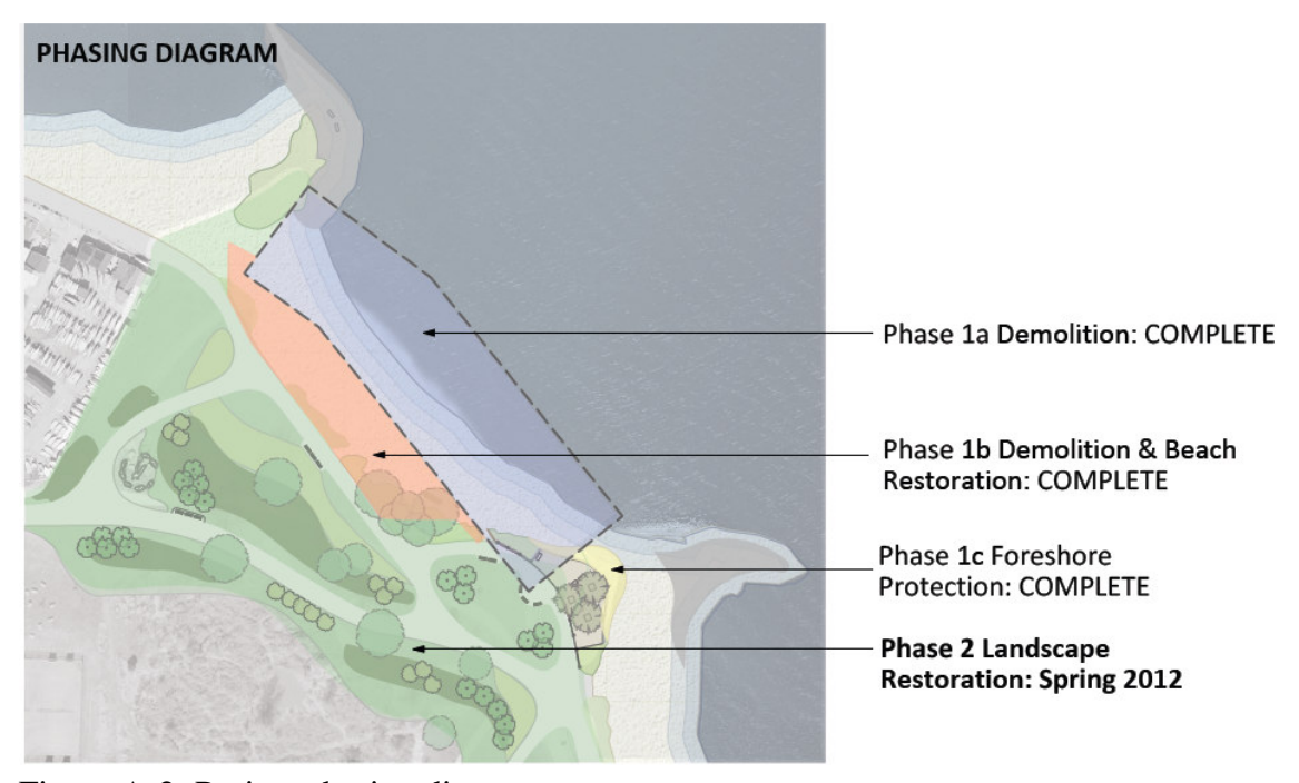
Figure A-2: Project phasing diagram