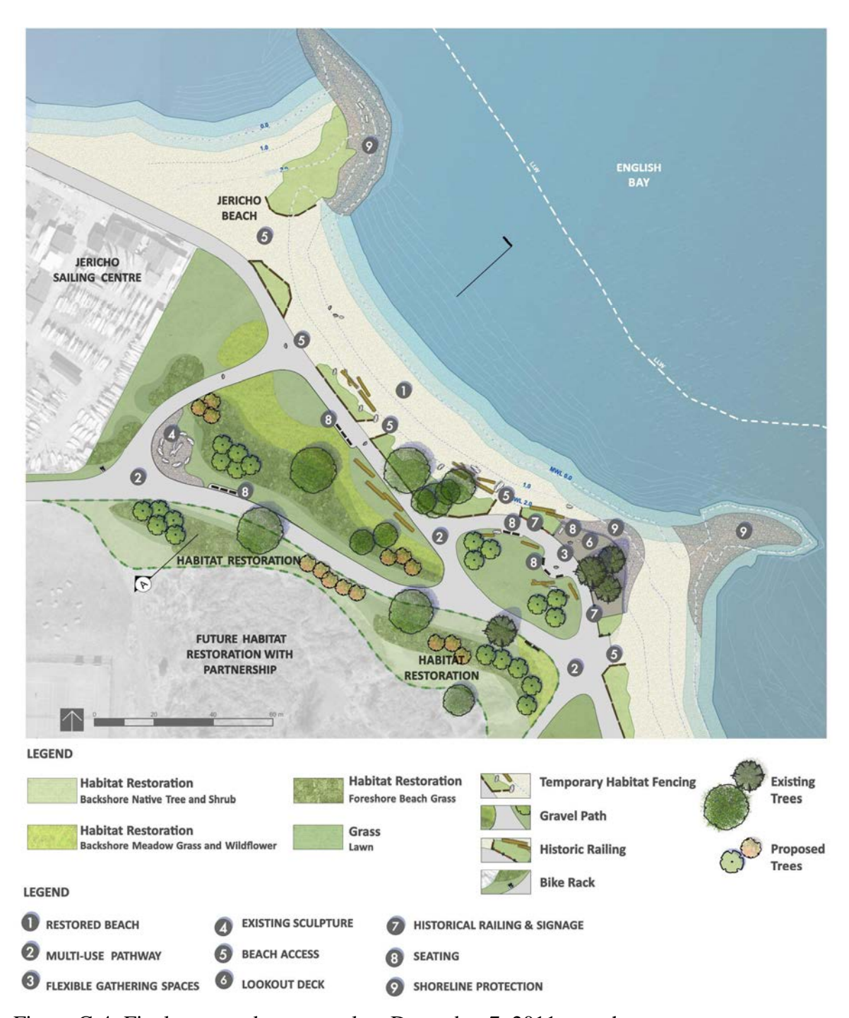
Figure C-4: Final proposed concept plan, December 7, 2011 open house