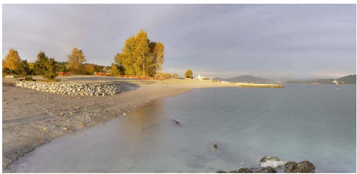
Figure B-1: Photo of a restored Jericho Beach, November 2, 2011