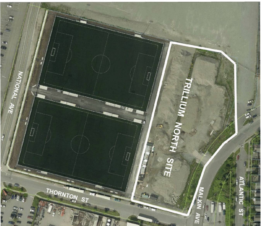
APPENDIX 1- TRILLIUM NORTH SITE AND CONTEXT MAP