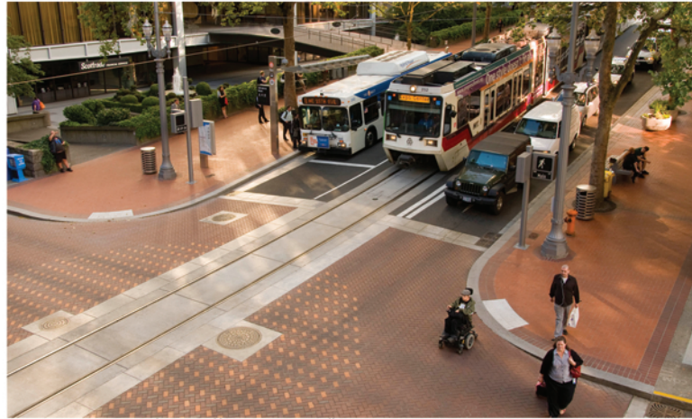
Paving patterns for pedestrian safety