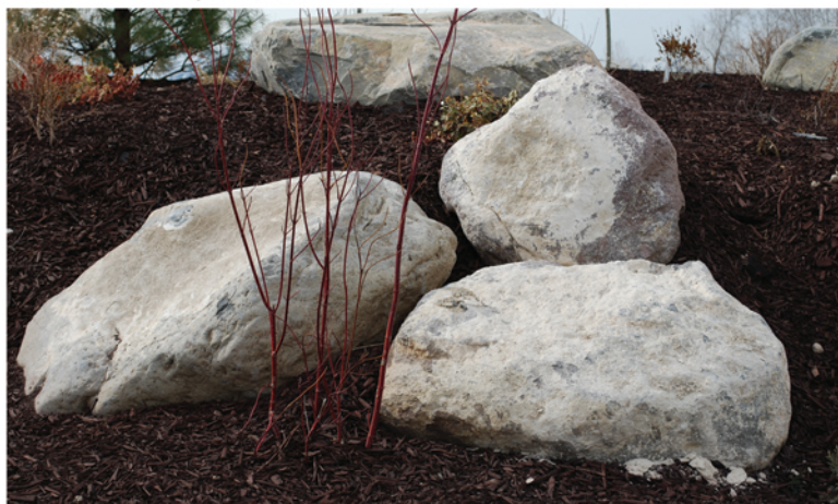
Emergent granite boulders