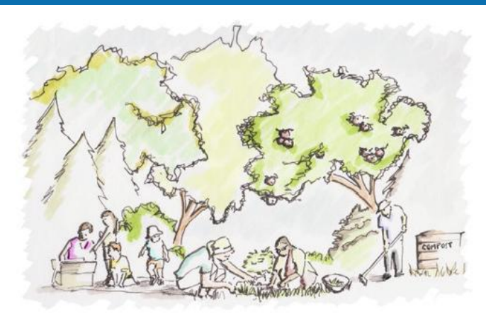
THE LOCAL FOOD ACTION PLAN OF THE VANCOUVER PARK BOARD