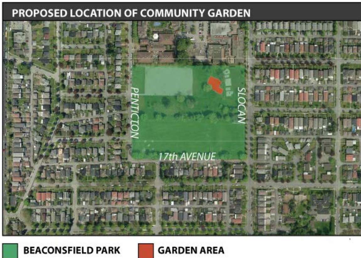
Figure 1: Location of proposed community garden in Beaconsfield Park

This proposed garden (Figure 2, next page) includes: