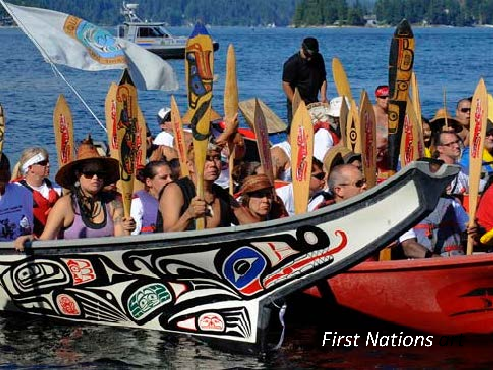
First Nations art