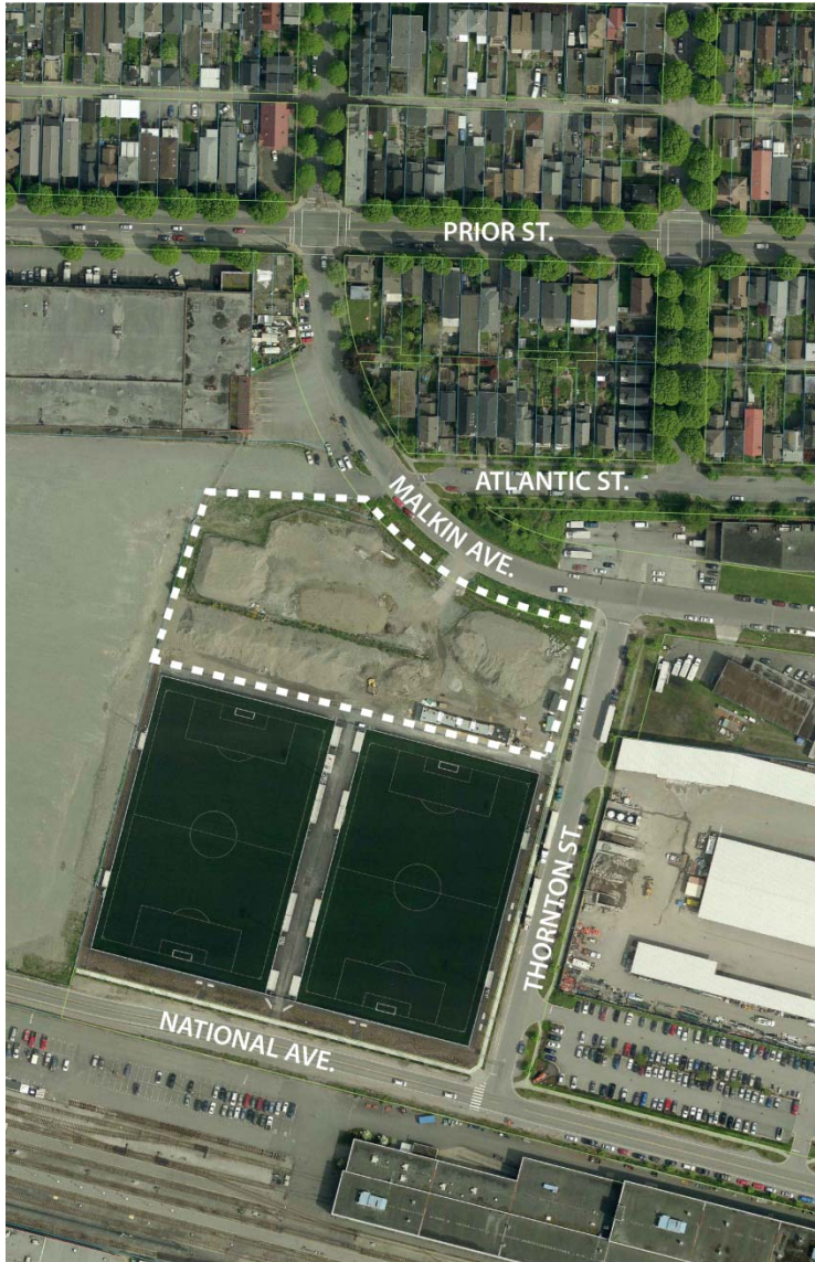
Figure 1: Location of proposed community learning garden in Trillium North Park

This proposed garden (Figure 2) includes: