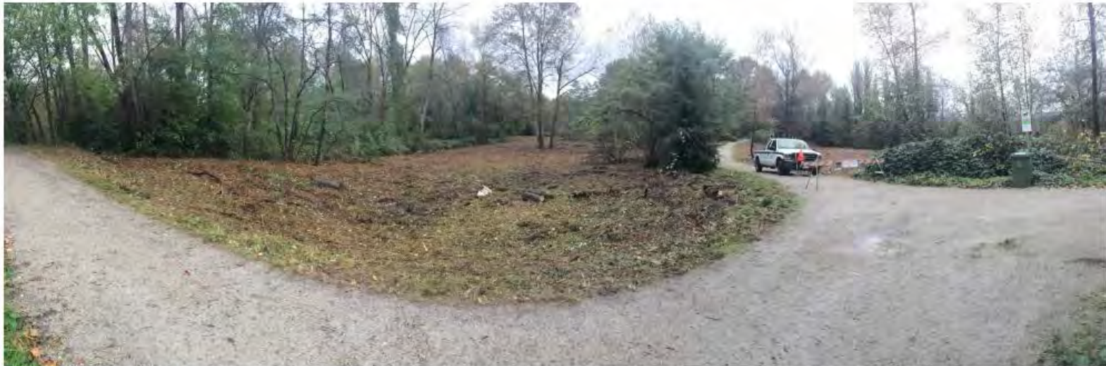
After: October 28, 2014