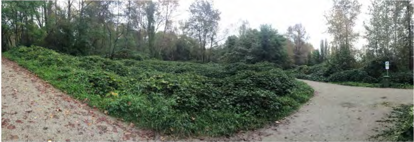
Before: October 17, 2014