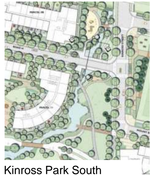
Kinross Park South