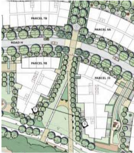
Neighbourhood Park South