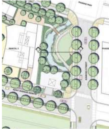
Kinross Park North