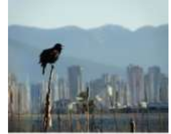
Vancouver Bird Strategy