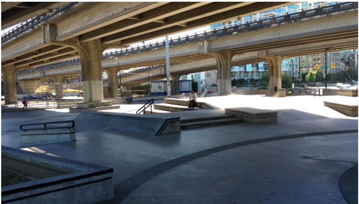
Figure 2. Existing Skate Plaza beneath Georgia and Dunsmuir viaducts

The street-style Skate Plaza was developed in 2004 by the Park Board to provide skateboarders with a safe alternative to skateboarding on the downtown streets and