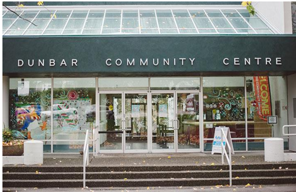
Dunbar Community Center