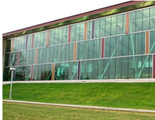
Killarney Community Center