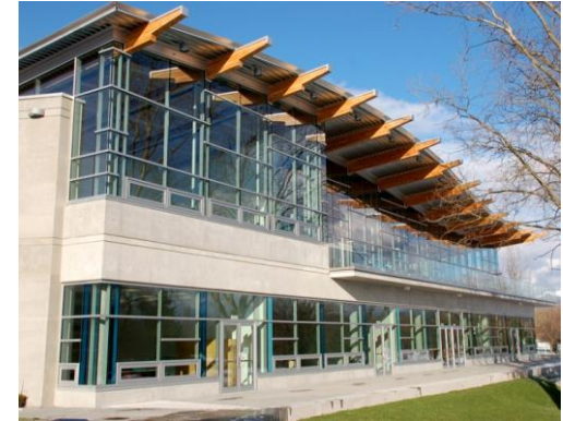
Trout Lake Community Centre