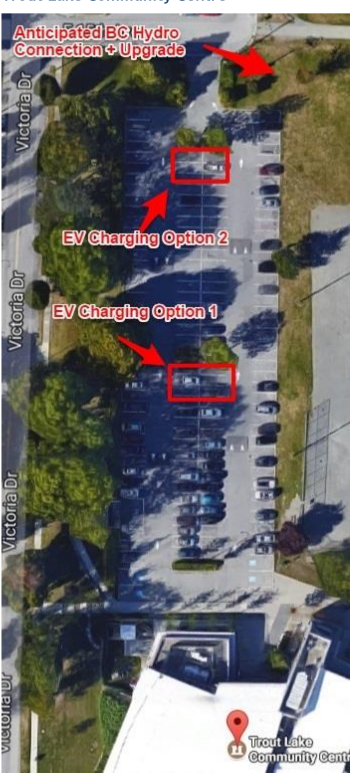
Figure 4 (left): Aerial photo showing the two proposed location options for EV charging infrastructure and approximate location of the anticipated tie-in with the BC Hydro distribution system.