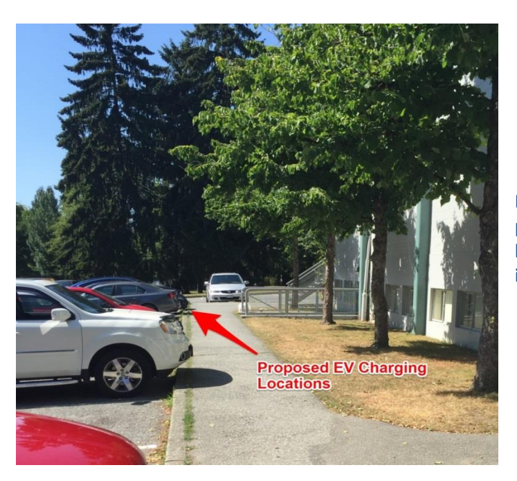
Figure 2 (left) - Photo of community Centre parking area (facing northwest). Proposed location of EV charging infrastructure is indicated in red.