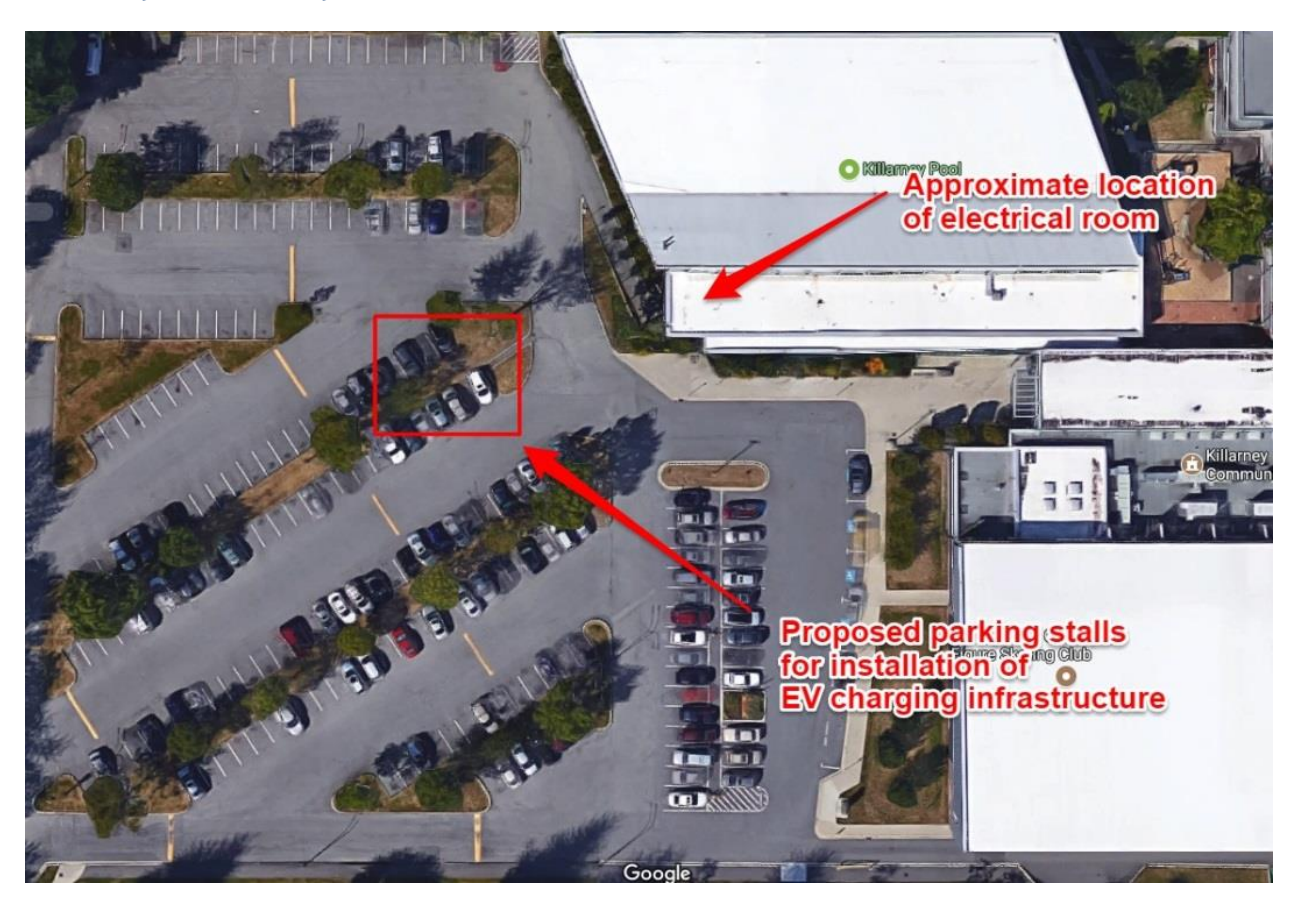
Figure 3 - Aerial photo showing proposed locations for EV charging infrastructure and approximate location of the building's electrical room.