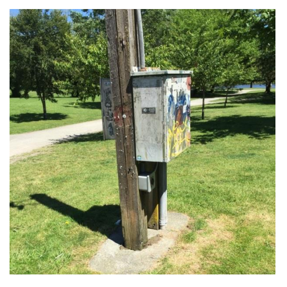
Figure 5 (above): Photo of anticipated connection point to BC Hydro electrical system at Trout Lake (facing northeast). Electrical supply at this location will require upgrades to supply more power to support EV charging infrastructure