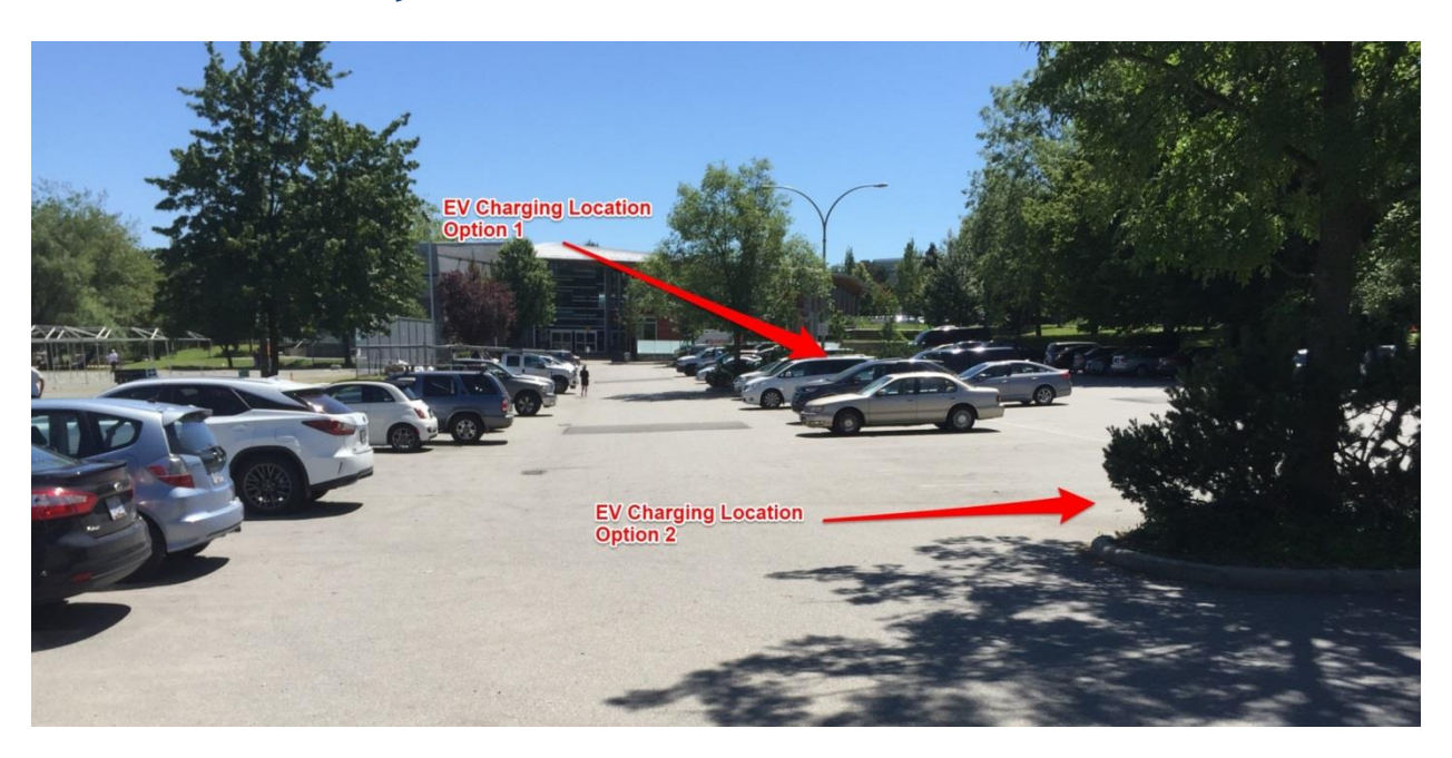
Figure 6: Photo of community centre parking area, facing south from anticipated BC Hydro connection point with the two possible location options for EV charging infrastructure noted in red.