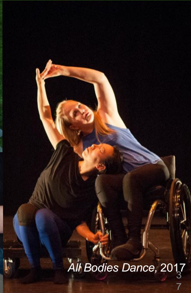
All Bodies Dance, 2017