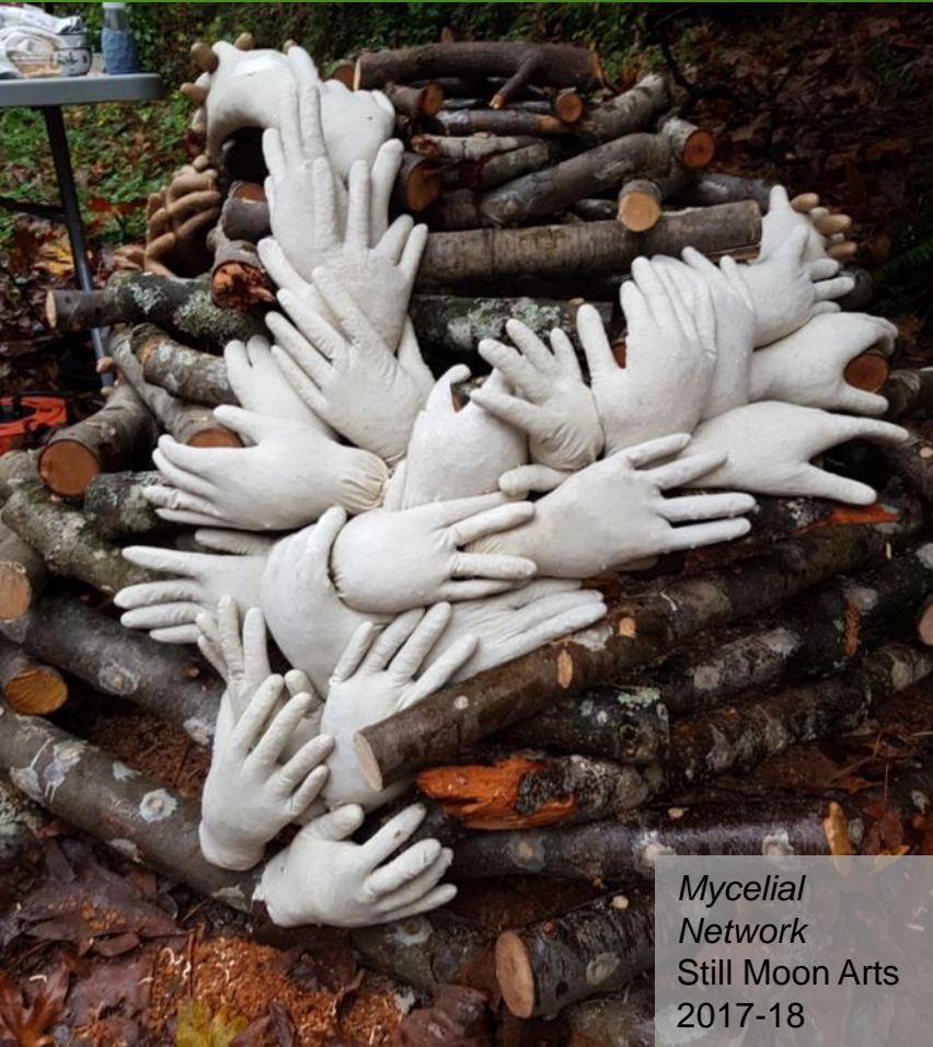
Mycelial Network Still Moon Arts 2017-18

25 funded projects in 2017/18, including: