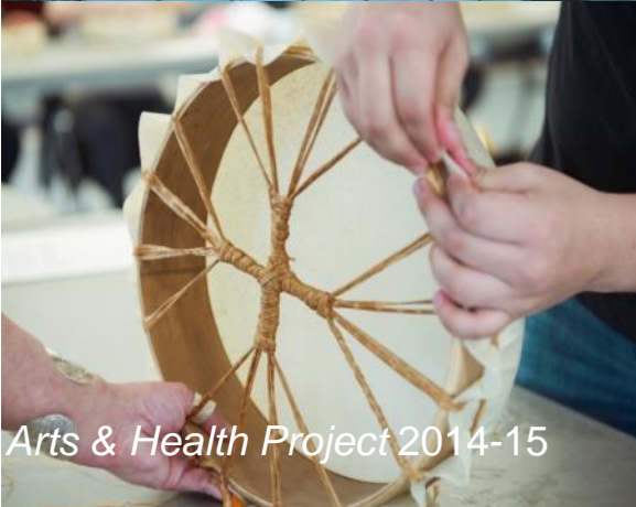
Arts & Health Project 2014-15