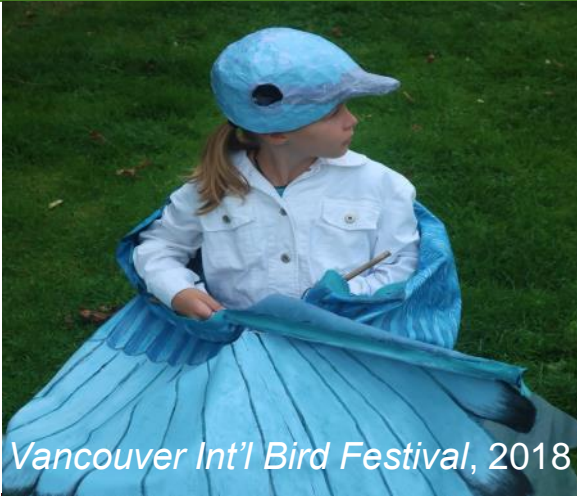
Vancouver Int'l Bird Festival, 2018