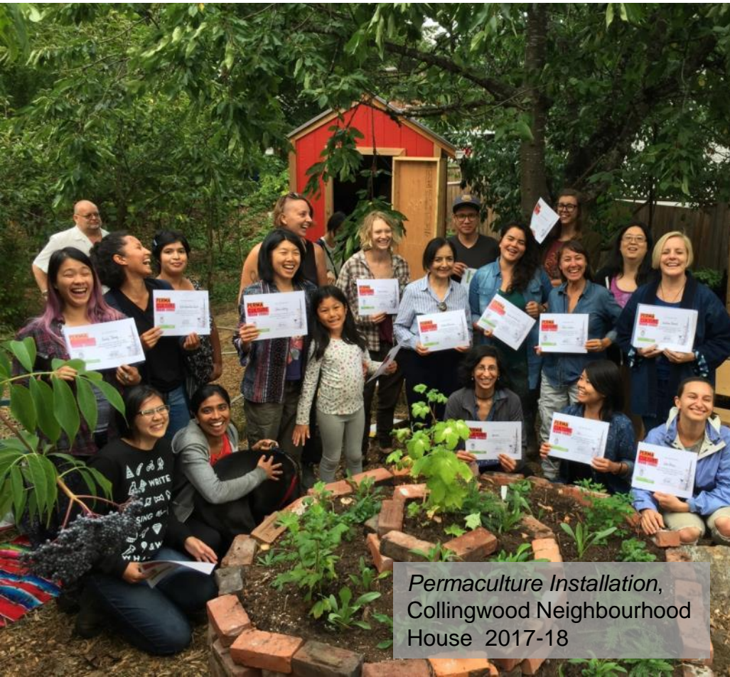
Permaculture Installation, Collingwood Neighbourhood House 2017-18