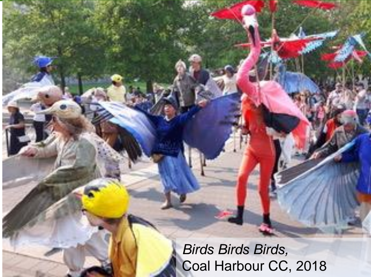
Birds Birds Birds, Coal Harbour CC, 2018

The Artists in Communities Project brings artists in residence into 3 community centres annually to work with staff and community for a full year on creative projects driven by community concerns and interests