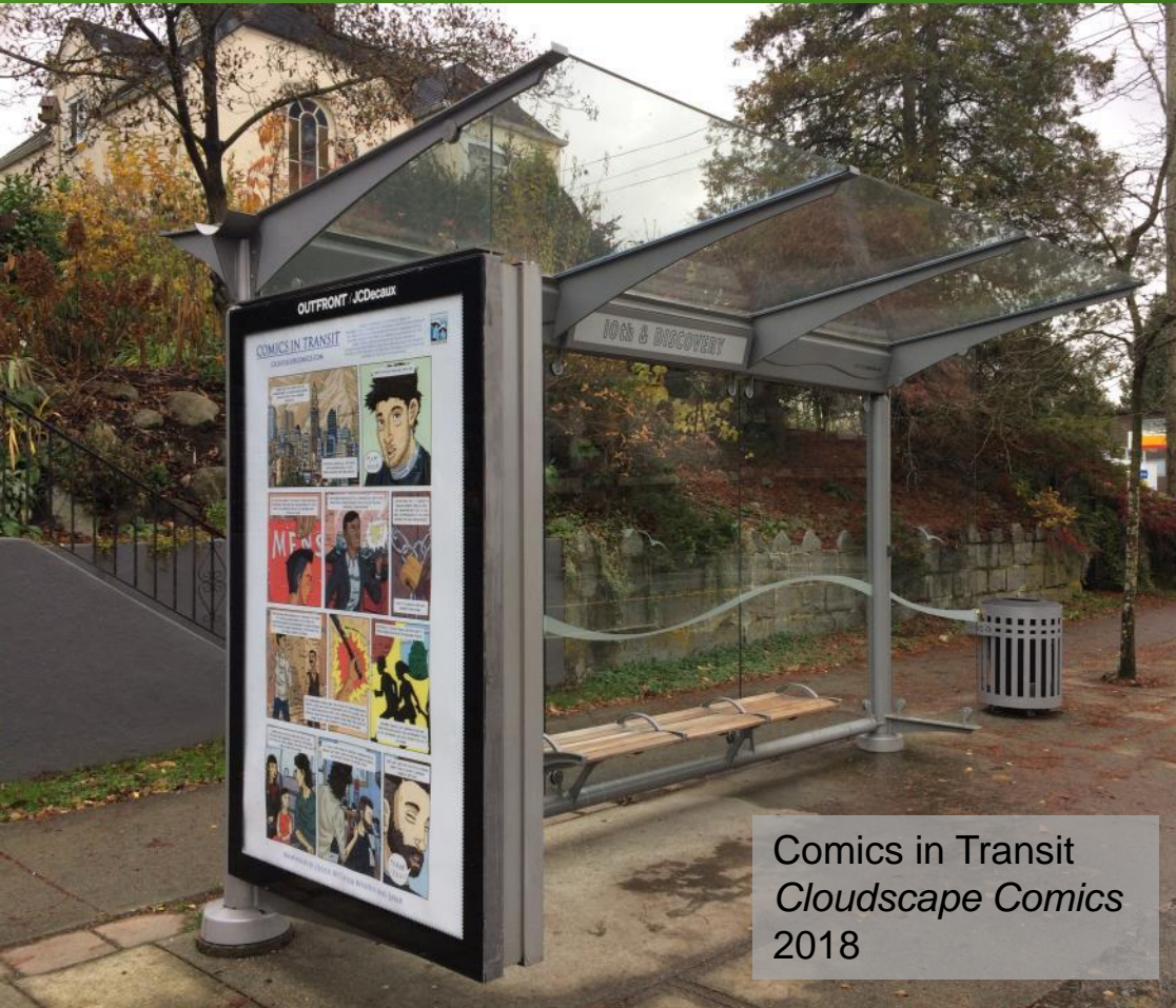
Comics in Transit Cloudscape Comics 2018

Building capacity in the arts contributes to community well-being. Fieldhouse artists and groups: