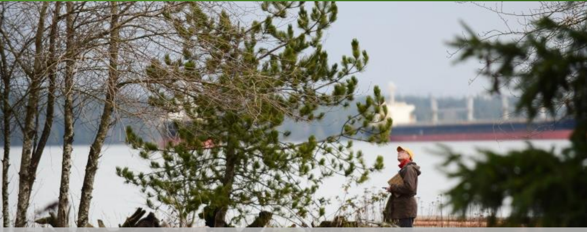
Eight trees at Spanish Banks have been intentionally vandalized, their tops sawed off and limbs removed. The trees are part of a grove of conifers at the foot of Tolmie Street.