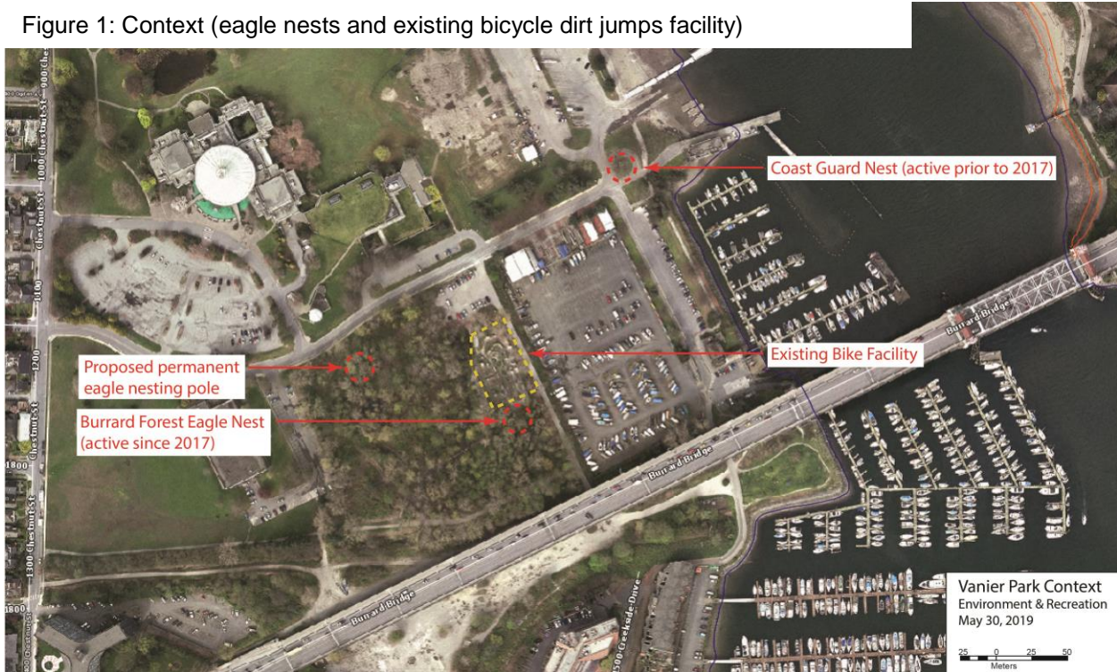
Figure 1: Context (eagle nests and existing bicycle dirt jumps facility)

While staff proceeded with the evaluation and public engagement, HWF requested that the existing dirt jump facility be closed during spring 2019 to minimize disturbance to the nesting eagles during the critical incubation period. The Park Board then closed the facility for eight (8) weeks from March 19 to May 10, 2019 and two eaglets hatched in early May. They are reported to be healthy at this time and are expected to fledge in July.