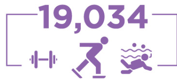
Leisure Access Program