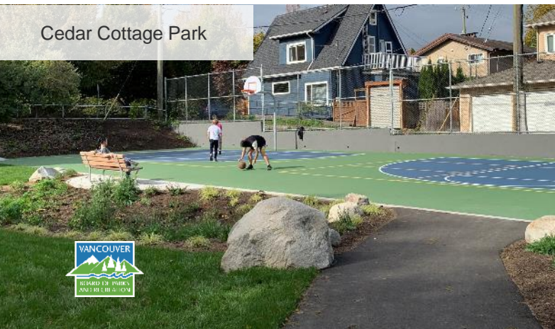
Cedar Cottage Park