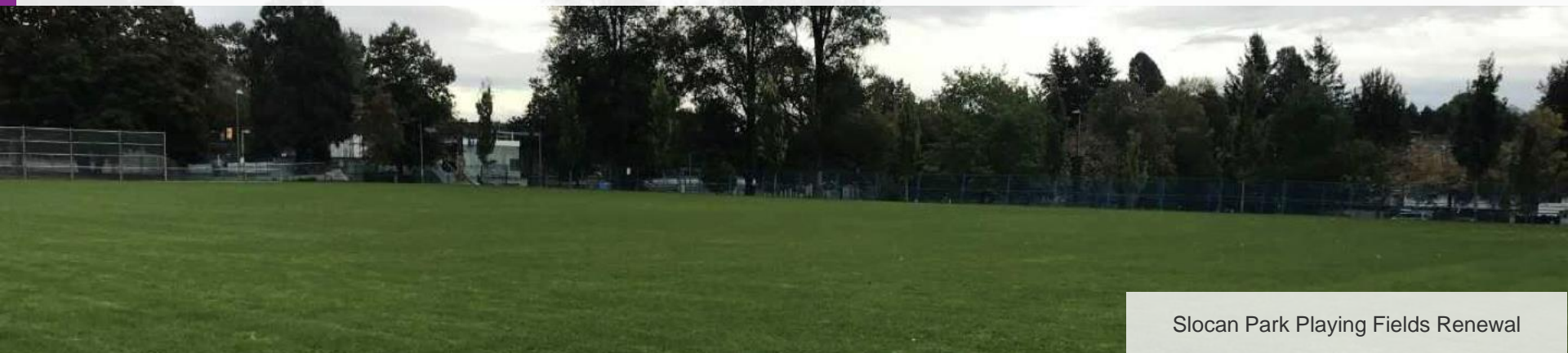
Slocan Park Playing Fields Renewal