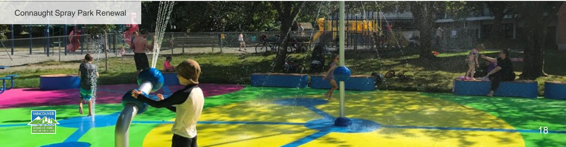
Connaught Spray Park Renewal