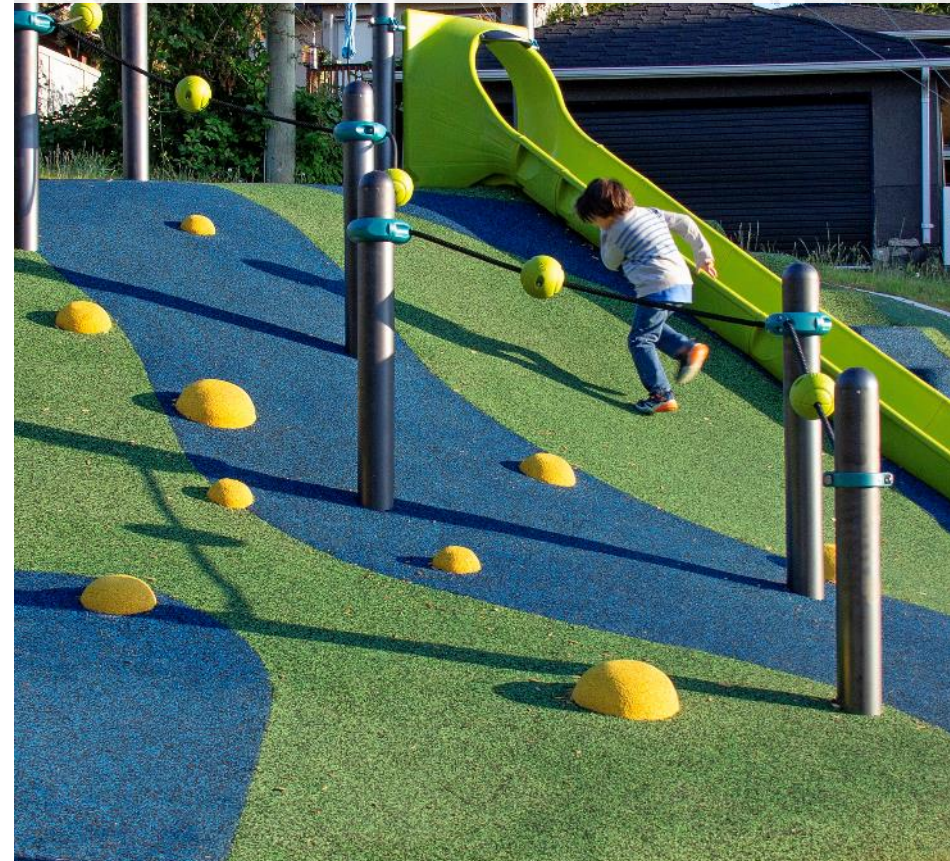
Kaslo Park Playground