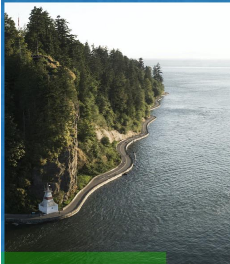
Stanley Park, Vancouver, Canada