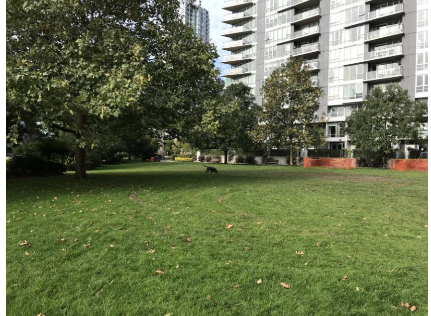
Existing Dog Off-Leash Area in Coopers' Park