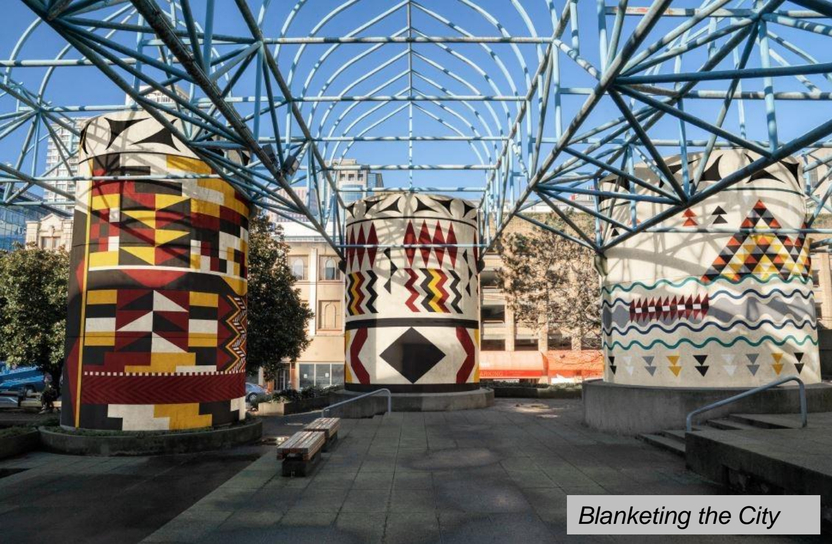
Blanketing the City