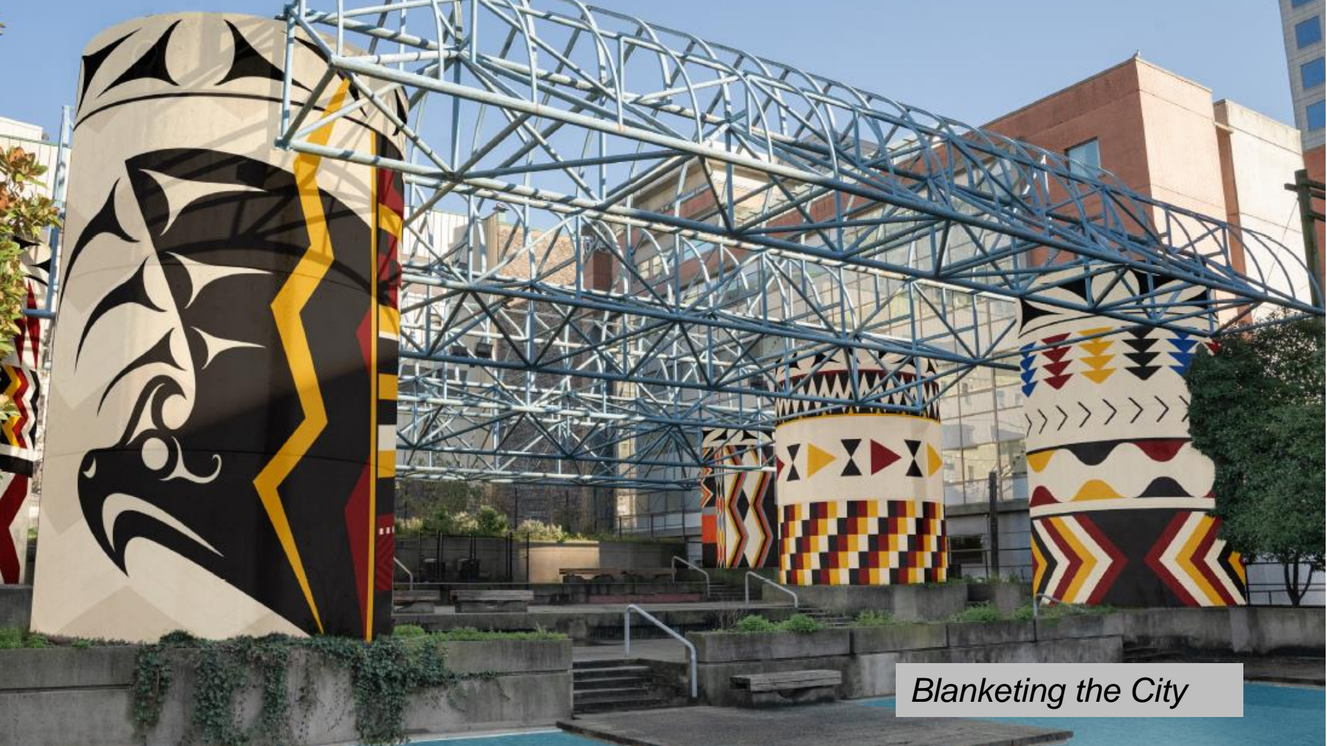
Blanketing the City