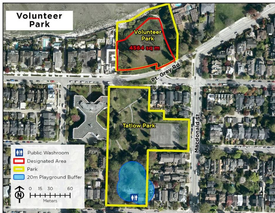
22. Volunteer Park - Designated Area