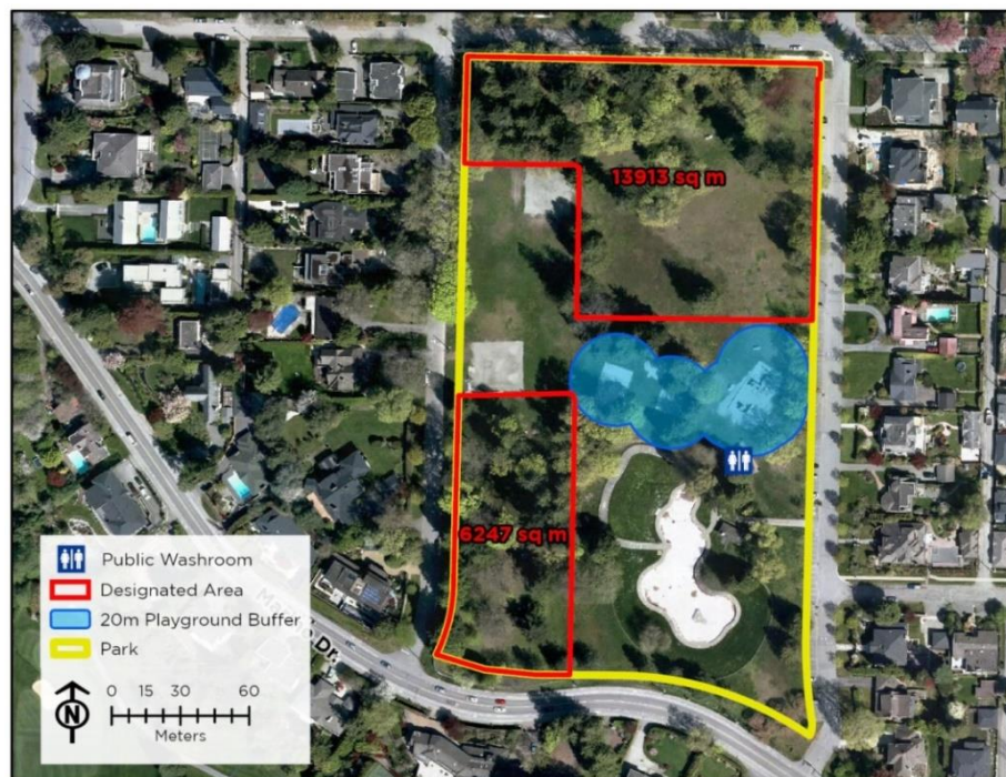
10. Maple Grove Park – Designated Areas (x2)