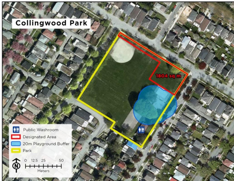
1. Collingwood Park – Designated Area