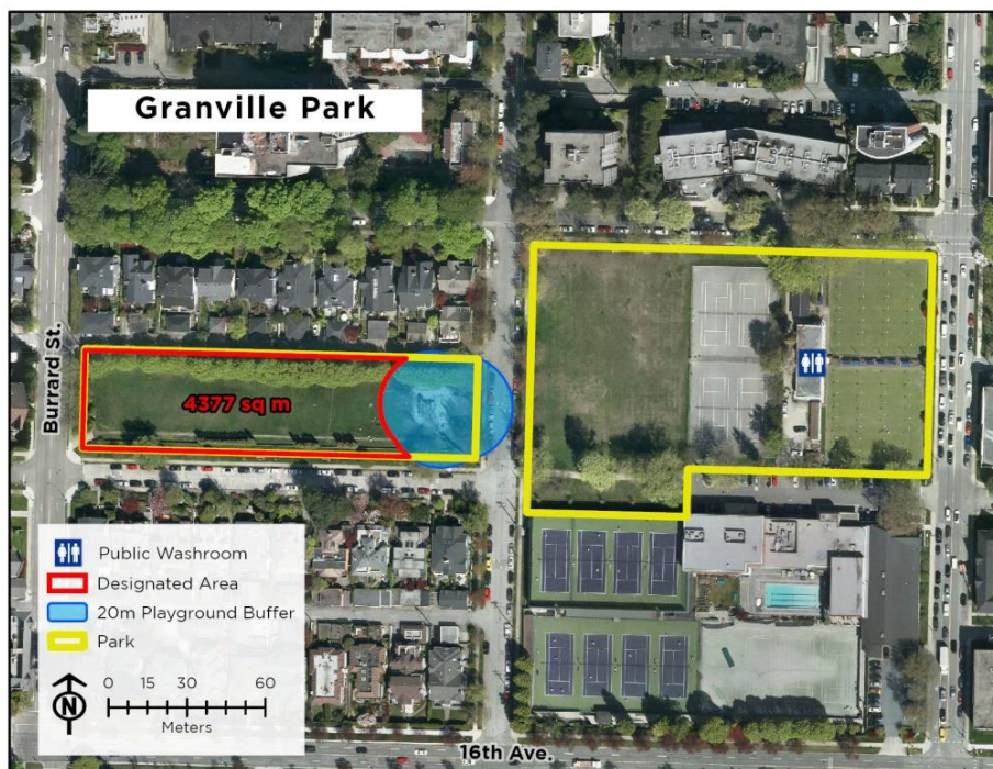
4. Granville Park – Designated Area