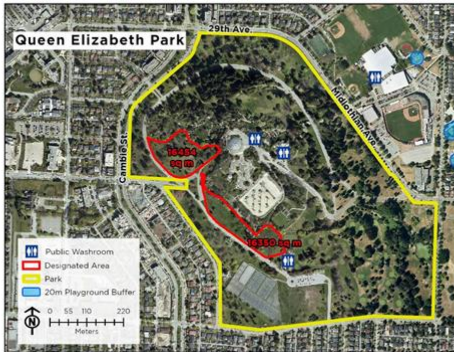
15. Queen Elizabeth Park – Designated Areas (x2)