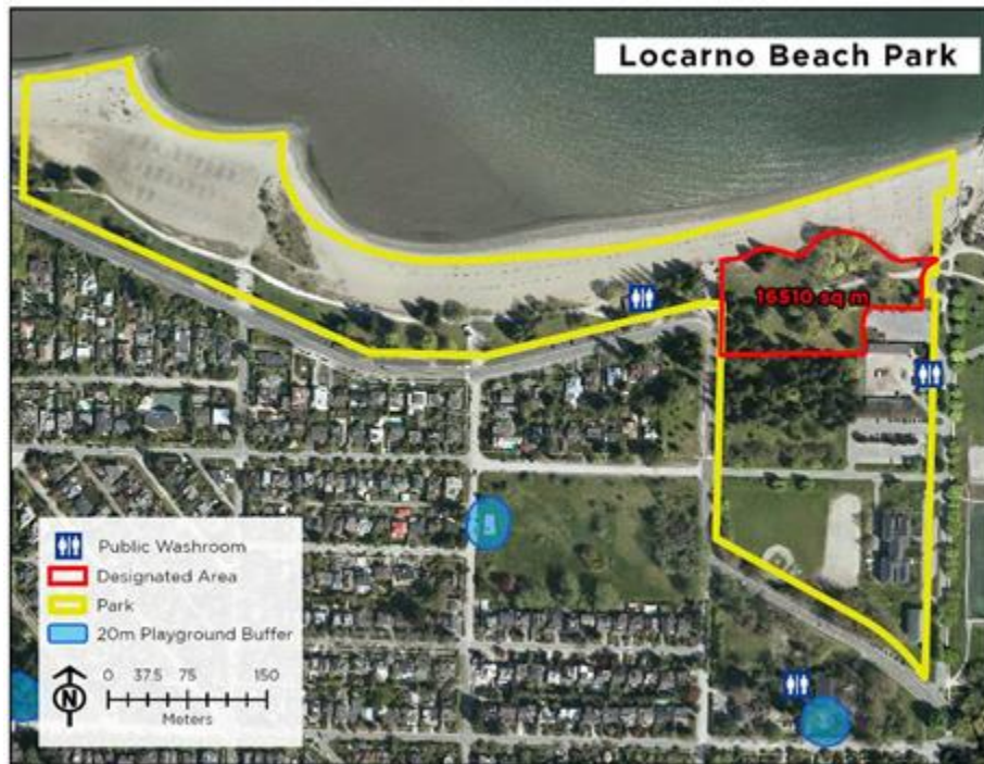
9. Locarno Beach Park – Designated Area