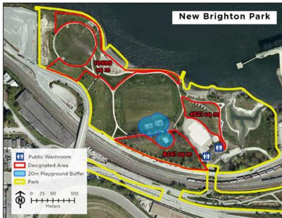
13. New Brighton Park – Designated Areas (x3)