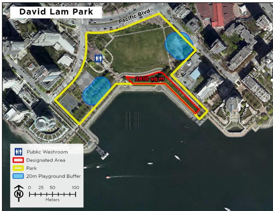
2. David Lam Park – Designated Area