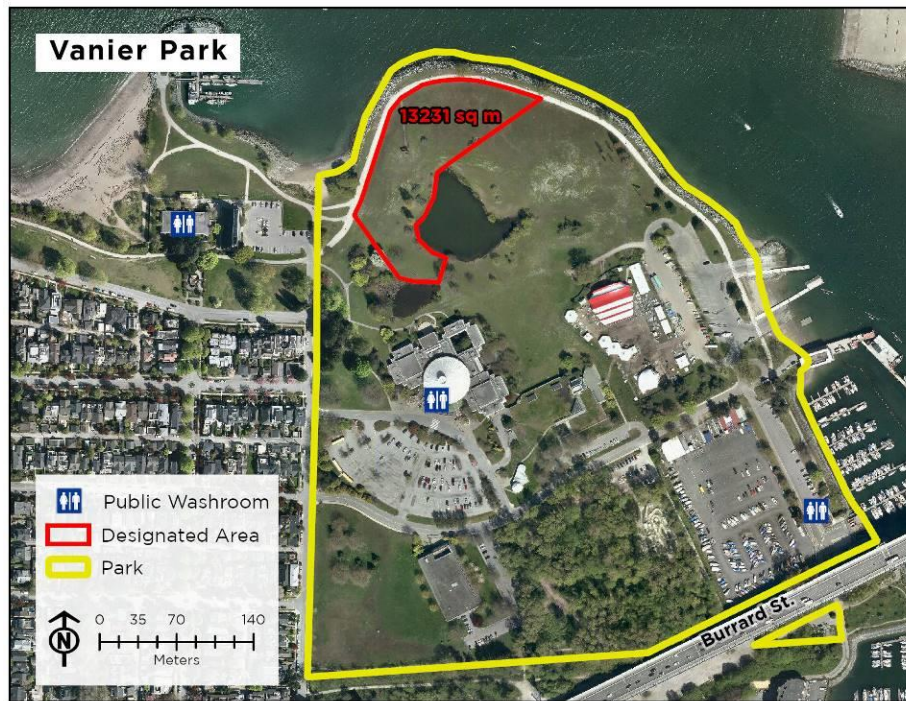
21. Vanier Park - Designated Area