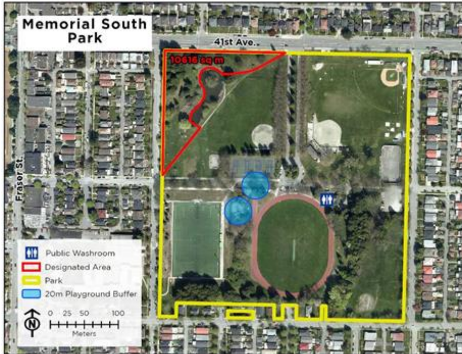
11. Memorial South Park – Designated Area