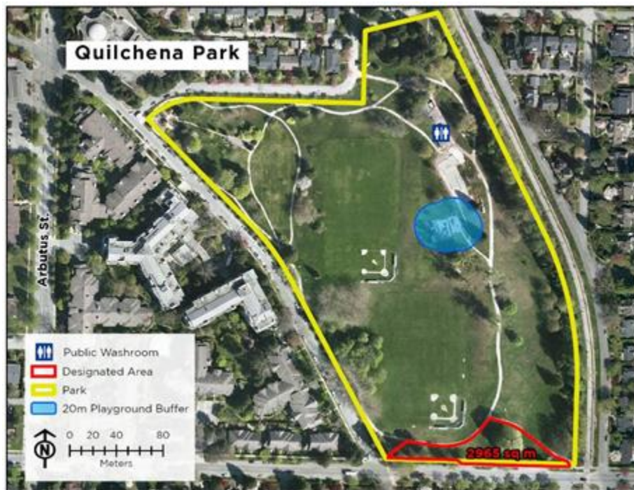
16. Quilchena Park – Designated Area