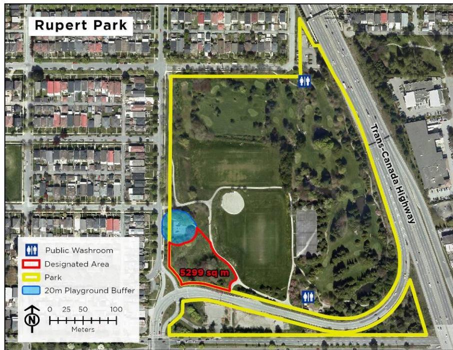
19. Rupert Park - Designated Area