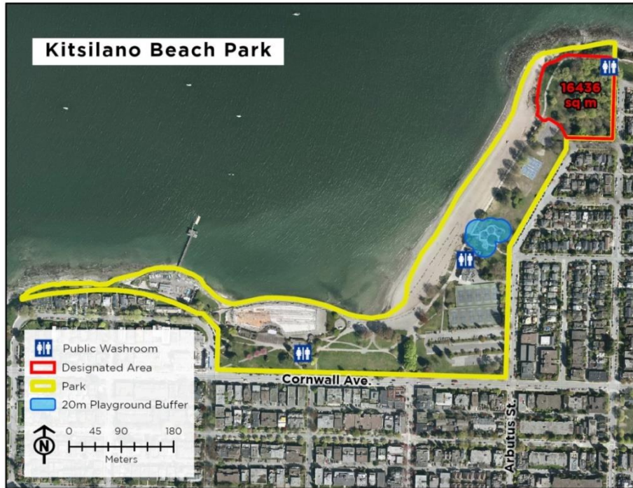
7. Kitsilano Beach Park – Designated Area