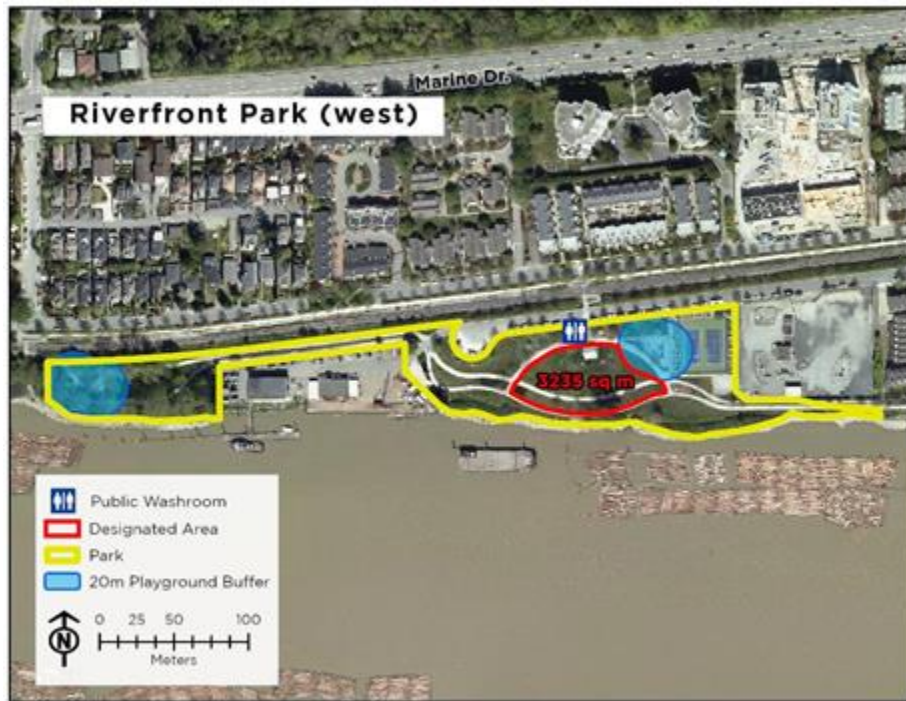
17. Riverfront Park (west) – Designated Area