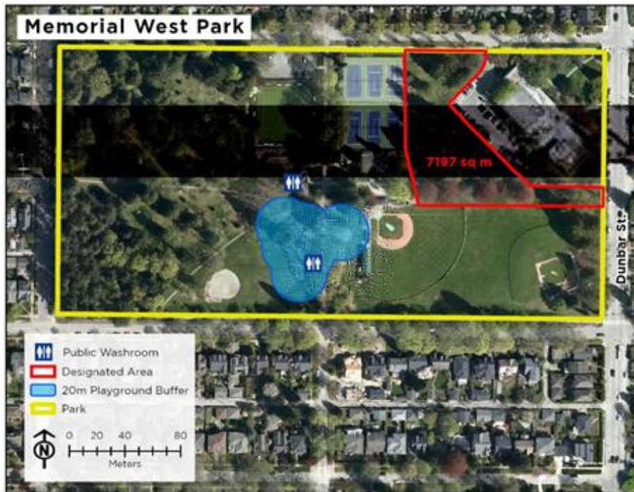
12. Memorial West Park – Designated Area