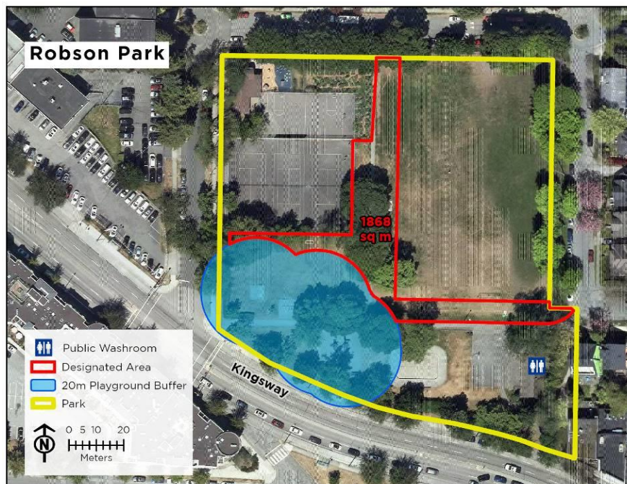
18. Robson Park – Designated Area