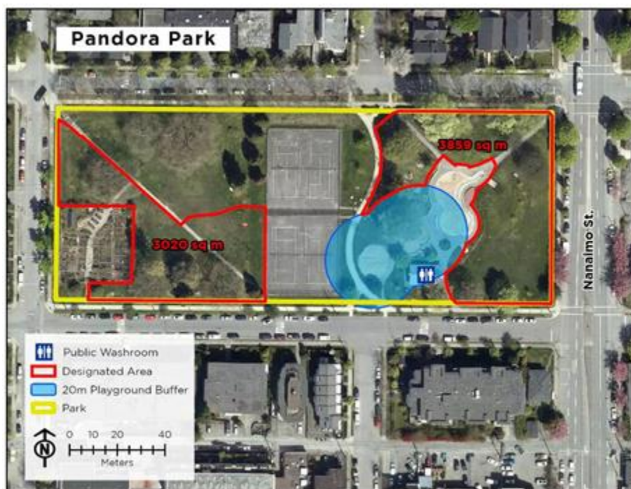
14. Pandora Park – Designated Areas (x2)