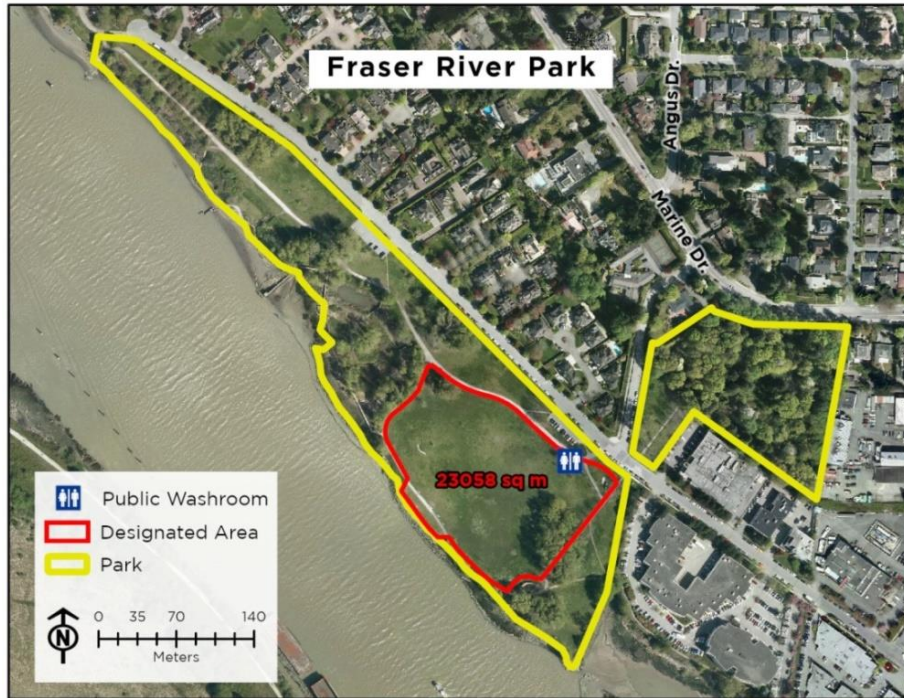
3. Fraser River Park – Designated Area