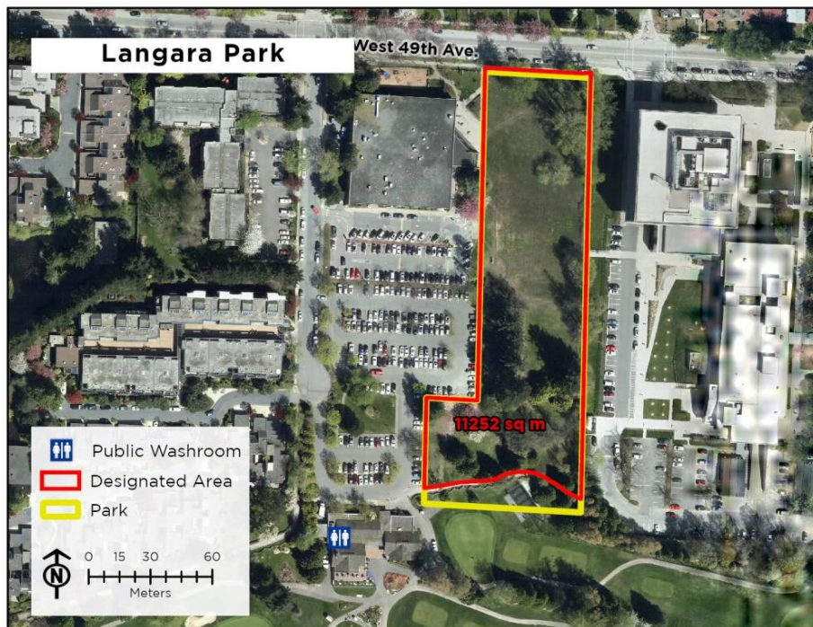
8. Langara Park – Designated Area