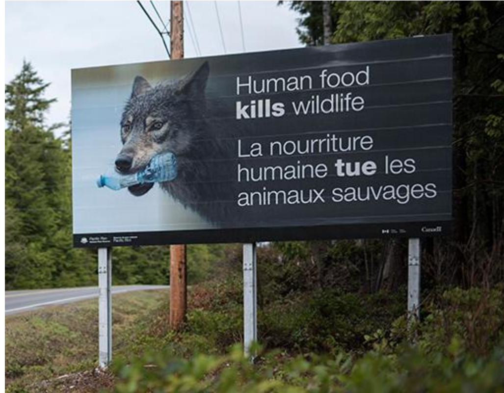
Pacific Rim National Park