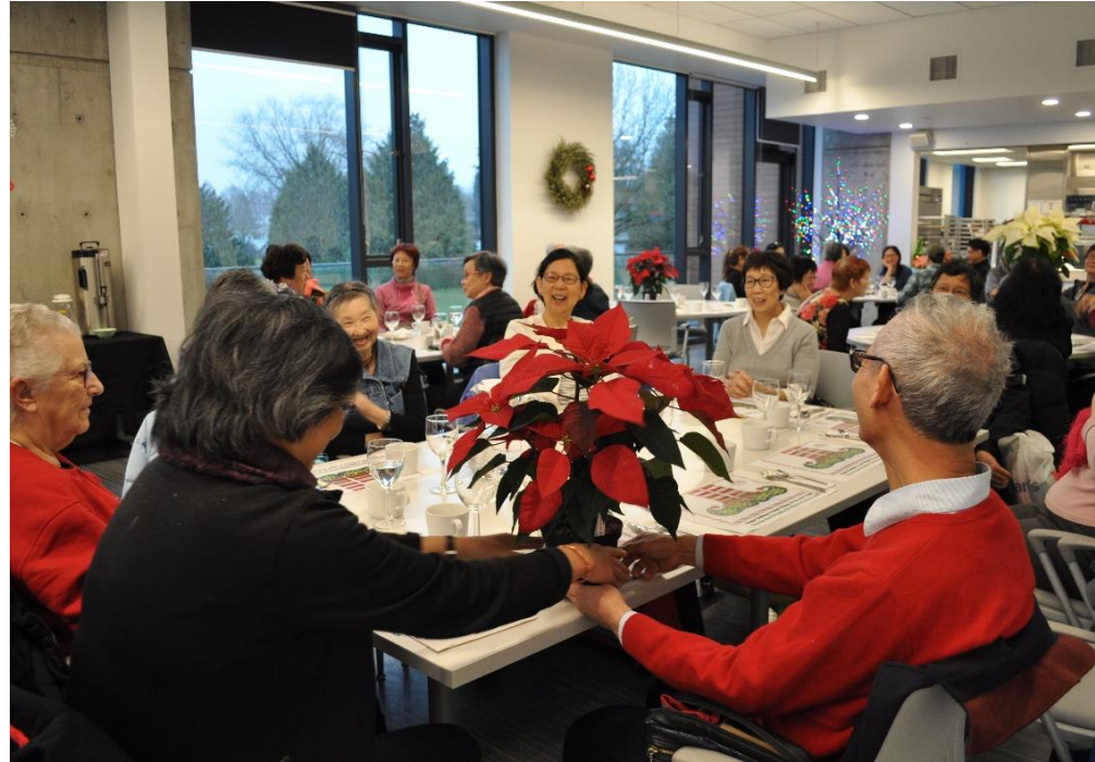
Killarney Seniors Centre