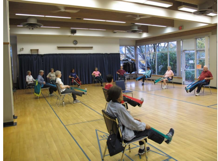
Chair Yoga class