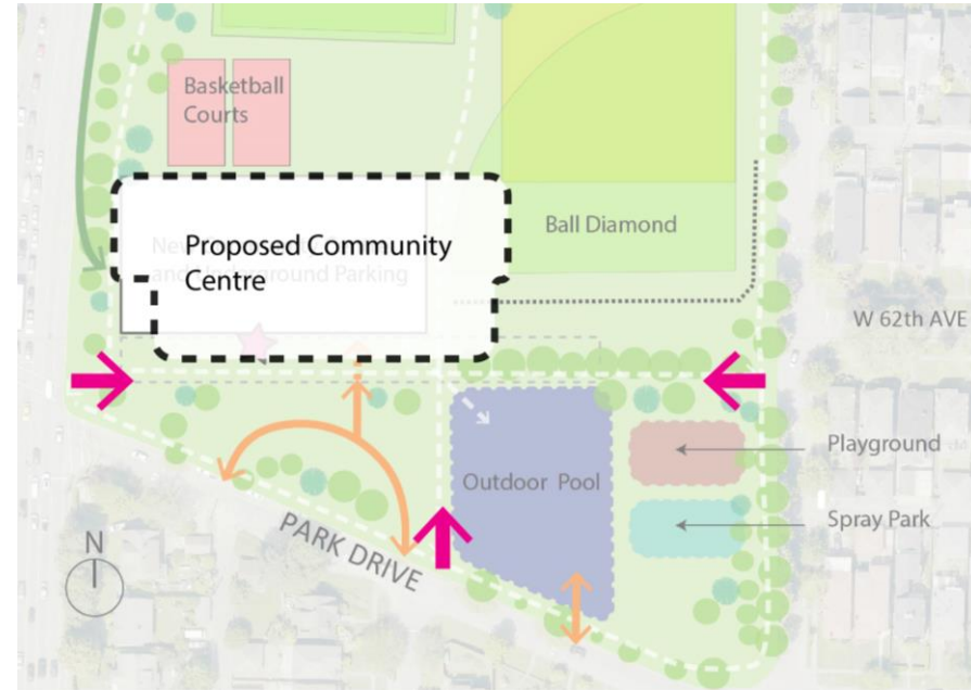
Draft Diagram Overlay for Proposed Marpole Community Centre