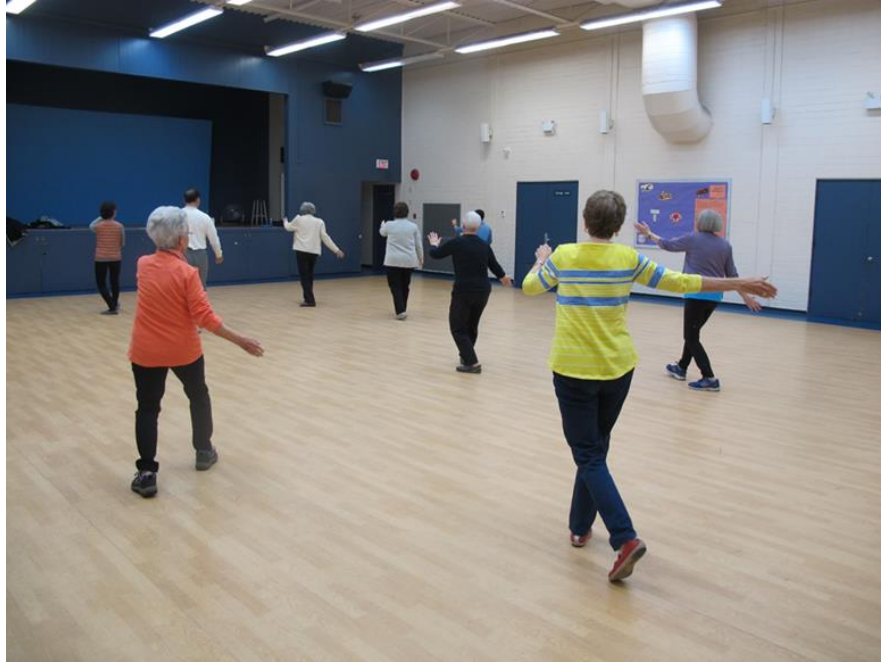
Tai Chi class