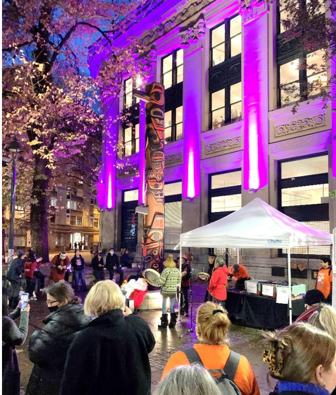
Photo: Survivors Pole Restoration, Pigeon Park