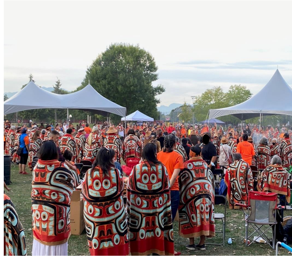
Residential School Survivor Blanketing Ceremony West Coast Family Night 2021.