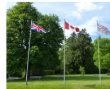
Figure 1 - Original Brockton Point Flag Poles

On April 28, 2017, Park Board Operations staff attended a SPIWG meeting to discuss the need to replace the three flagpoles at Brockton Point (see Figures 1 & 2 for images of the original flags and location). The poles, installed in the mid 1960's, were in poor condition and had become a safety risk. The working group approved the replacement of the poles, contingent on archeological protocols being followed. The three new poles were installed in late 2019 and are now ready for new flags.