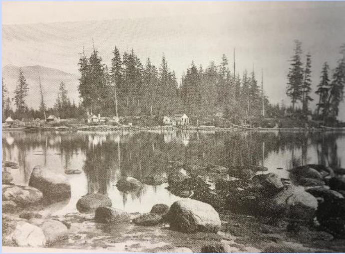
MST Villages at Brockton Point (1886)