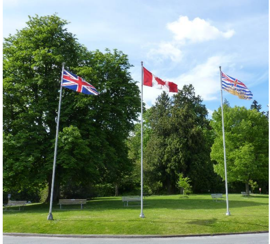
Existing Flagpoles (2017)