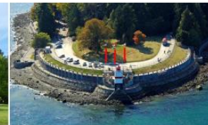
Figure 2 - Flag location at Brockton Point