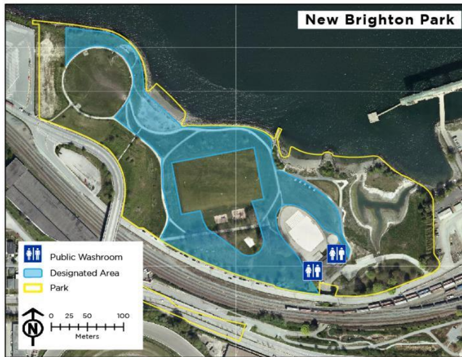
13. New Brighton Park – Designated Area