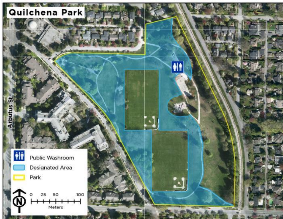
16. Quilchena Park – Designated Area