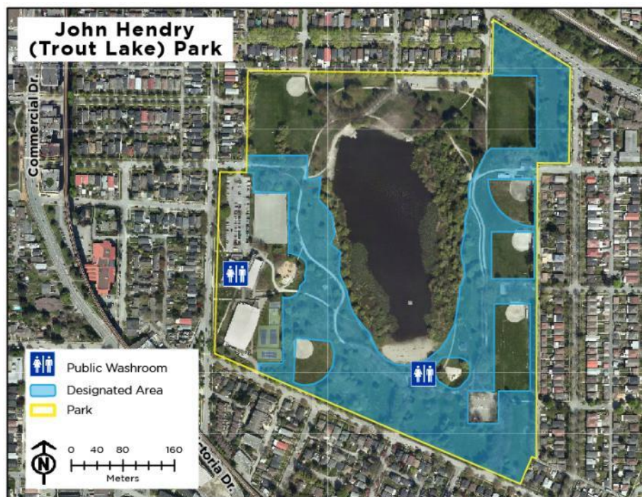
6. John Hendry (Trout Lake) Park – Designated Area