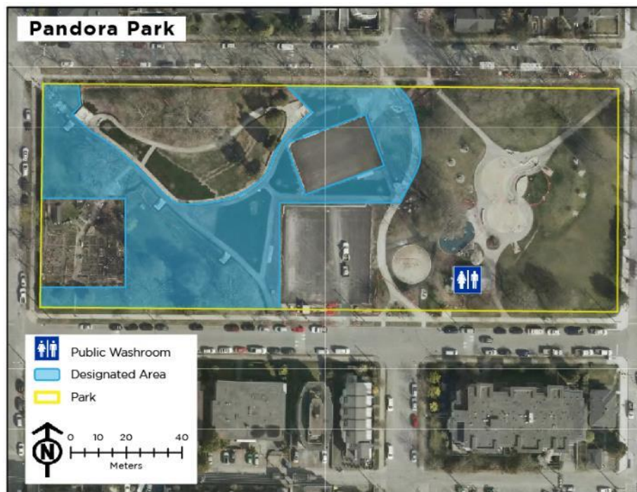
14. Pandora Park – Designated Area