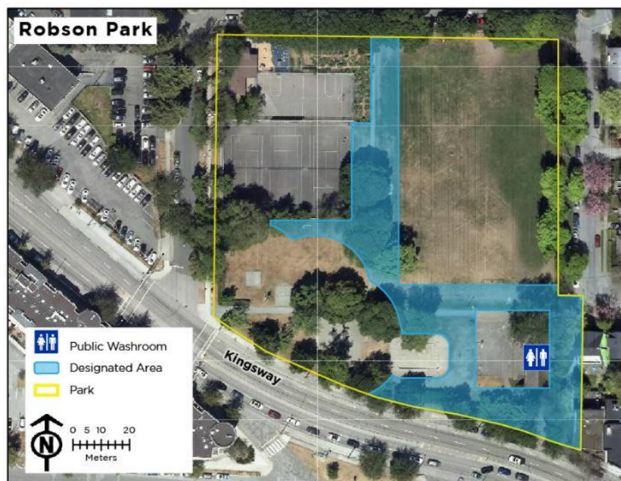
18. Robson Park – Designated Area