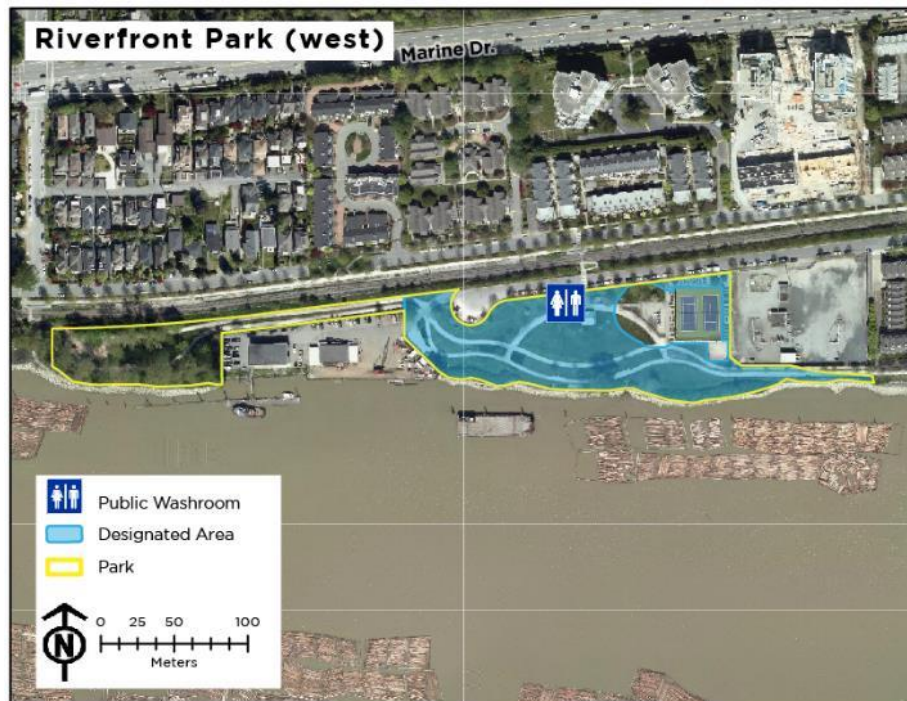
17. Riverfront Park (west) – Designated Area