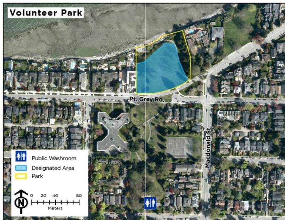
22. Volunteer Park - Designated Area