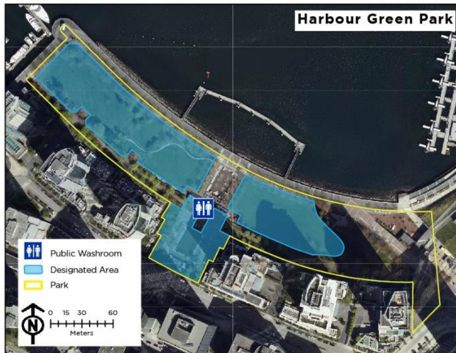
5. Harbour Green Park – Designated Area