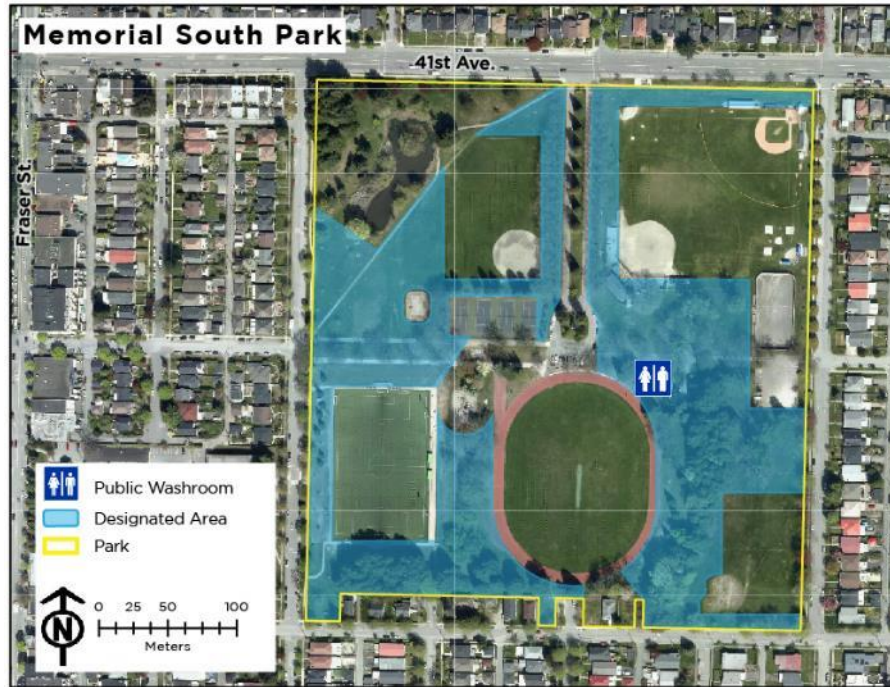
11. Memorial South Park – Designated Area