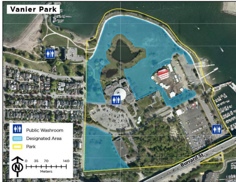
21. Vanier Park - Designated Area