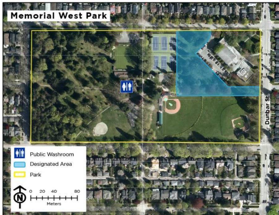
12. Memorial West Park – Designated Area