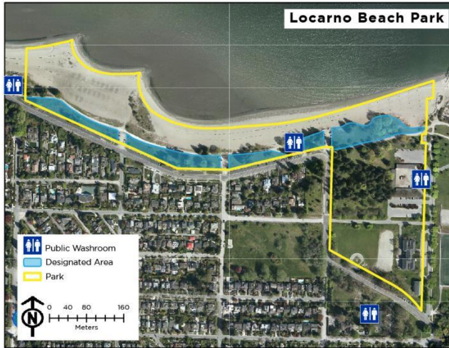
9. Locarno Beach Park – Designated Area