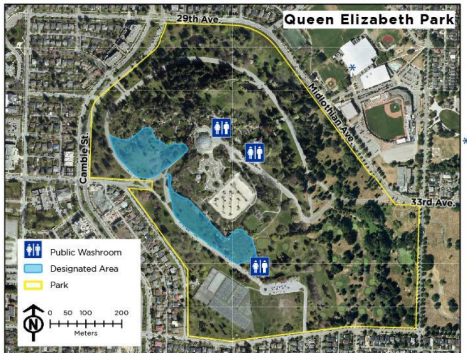
15. Queen Elizabeth Park – Designated Area