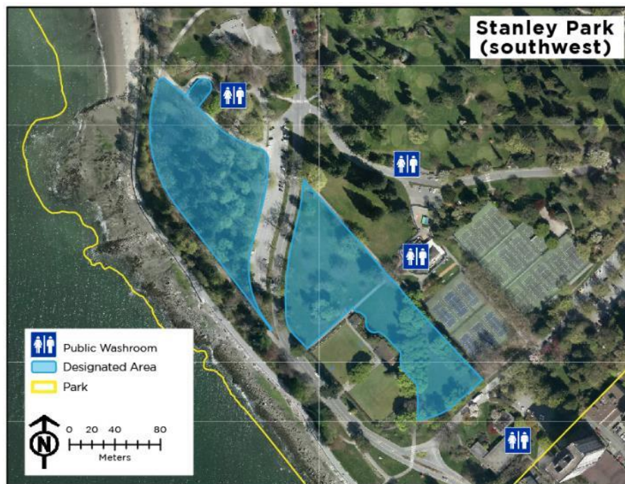
20. Stanley Park (southwest) – Designated Area