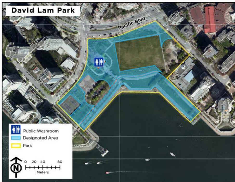
2. David Lam Park – Designated Area