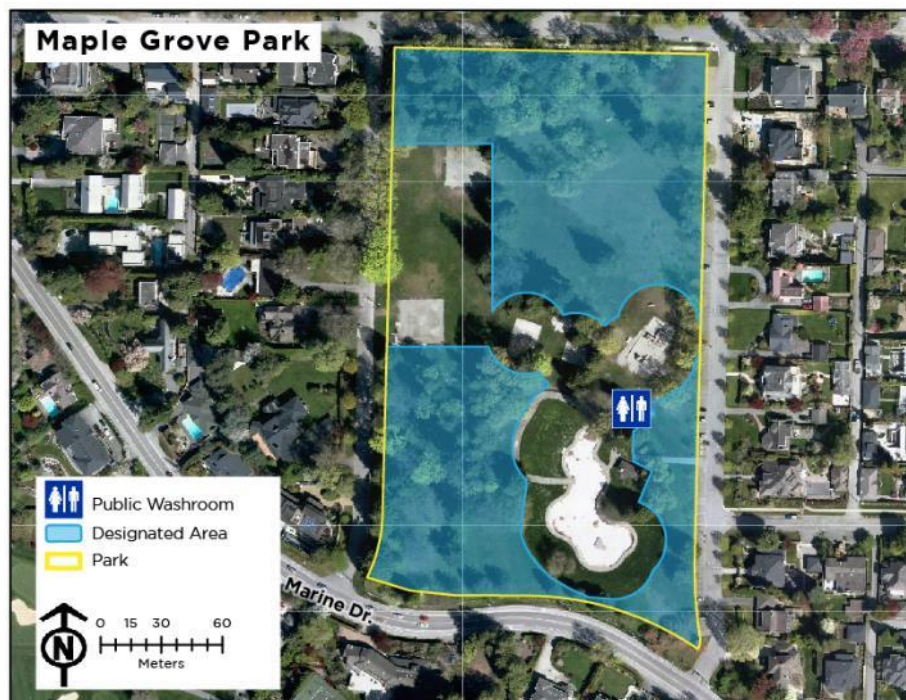
10. Maple Grove Park – Designated Area