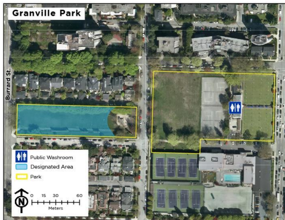
4. Granville Park – Designated Area