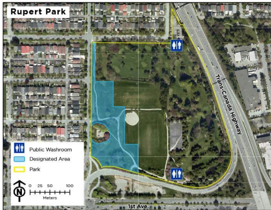
19. Rupert Park - Designated Area