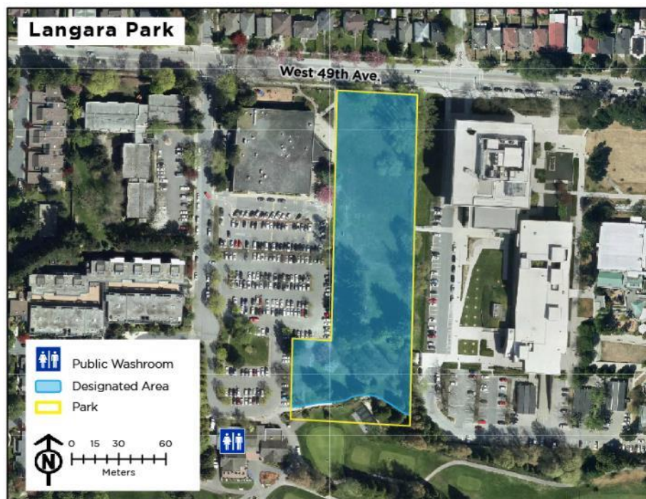
8. Langara Park – Designated Area