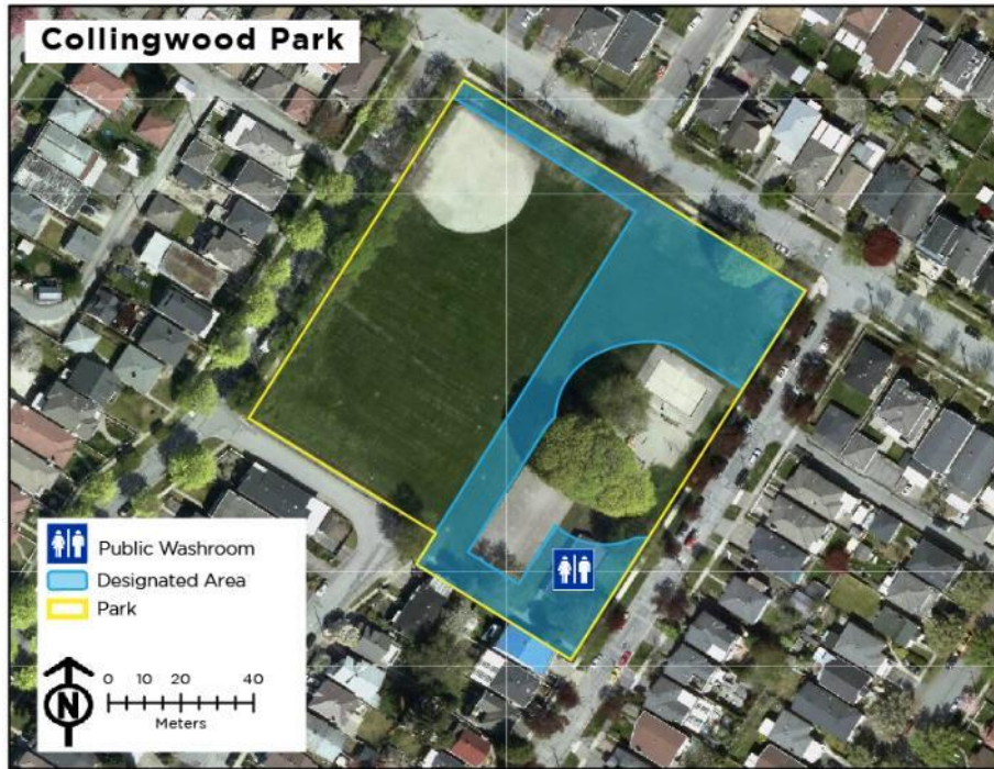
1. Collingwood Park – Designated Area