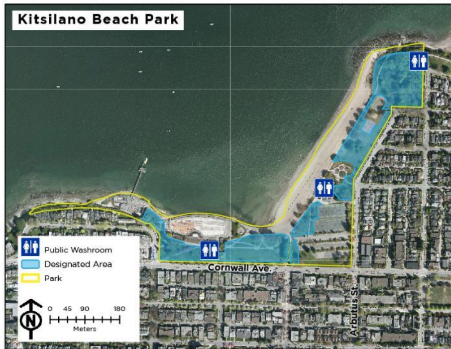
7. Kitsilano Beach Park – Designated Area