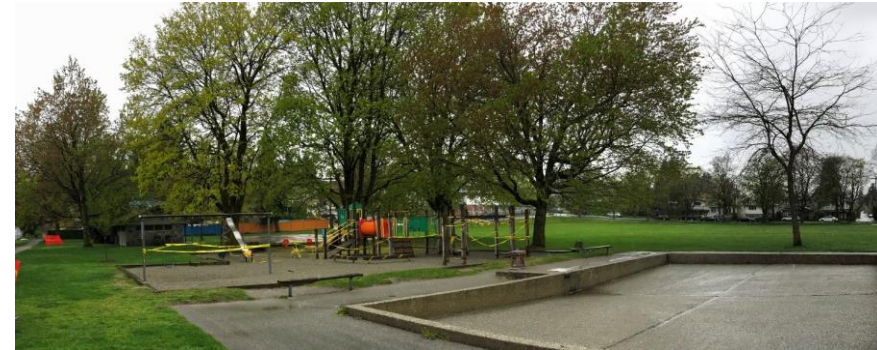
Looking south west from McKinnon Street