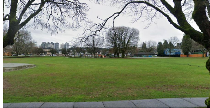
Looking east from Taunton Street