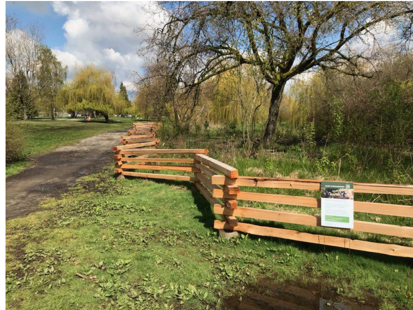
Riparian bird habitat in John Hendry Park