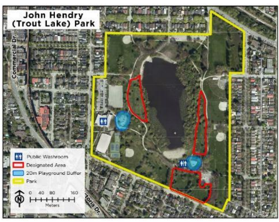
John Hendry (Trout Lake) Park Public Washroom Designated Area